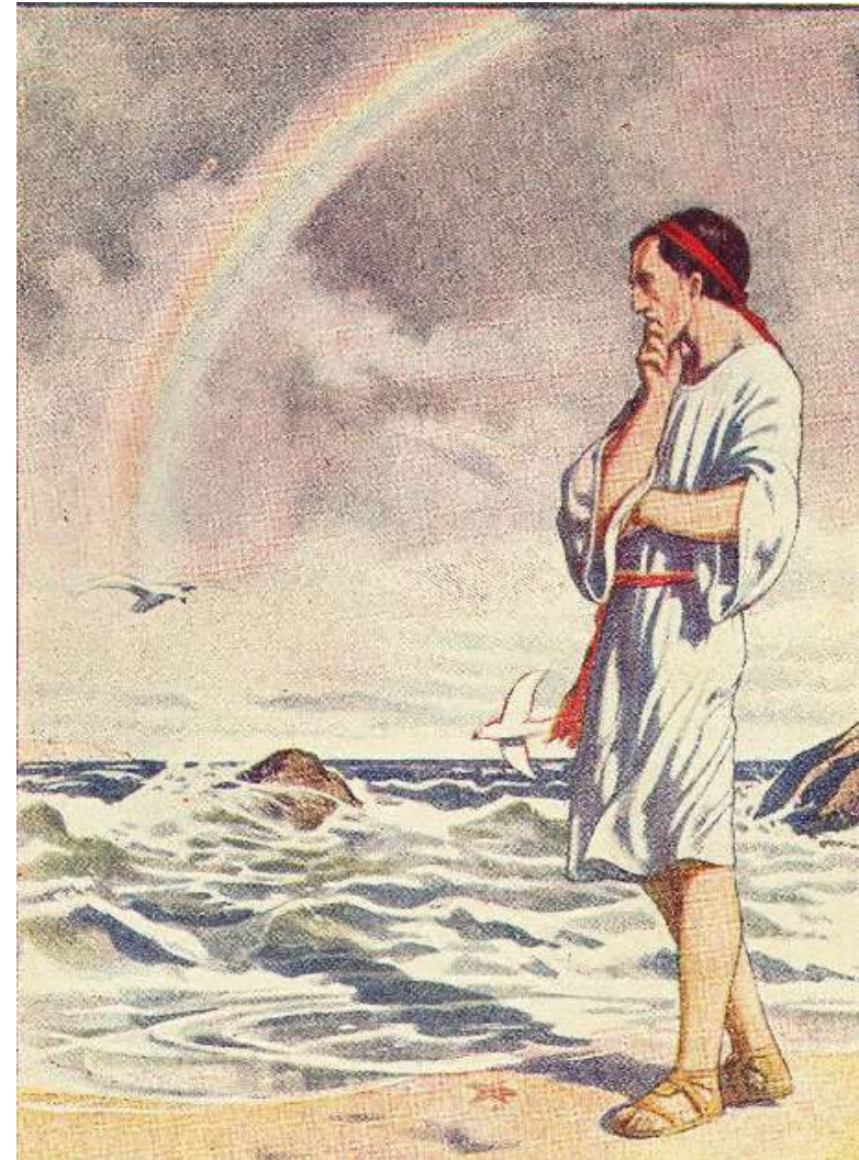
DEMOSTHENES IN EXILE

sure of what really happened. Of one thing we are sure—that Demosthenes did not want, nor use, the money for himself. He wished the city to be rich enough to fight King Alexander again some day, and thought it fair to take Alexander's money to use in that way. For then, as now, men believed that "All's fair in love and war."