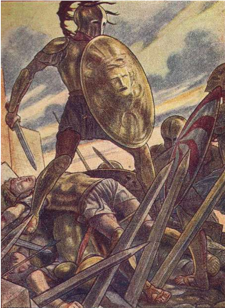
PELOPIDAS AND EPIMANONDAS

country, and the truest friend ever a man might wish to know. He never forgot that he owed his life to Epaminondas. And in Epaminondas he found a friend true as steel, loyal and generous as himself, though they were unlike in many ways.