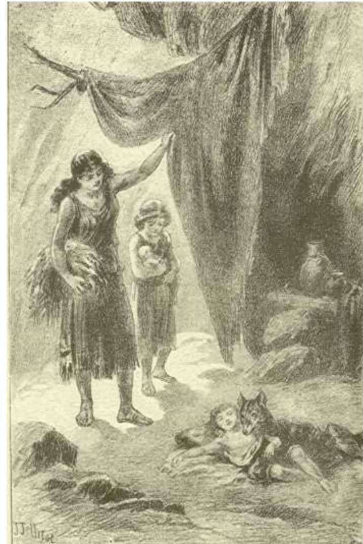
THE CAVE AMONG THE MOUNTAINS

Permission to use Heritage History documents or images for commercial purposes, or more information about our collection of traditional history resources can be obtained by contacting us at Infodesk@heritage-history.com .