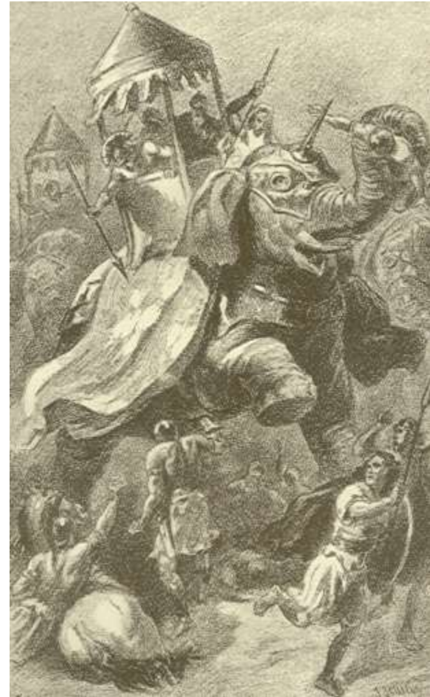
THE DEATH OF ELEAZER.

with enthusiasm—such enthusiasm, indeed, that Judas felt it necessary to give him a parting caution. "Remember," he said, "if this scheme fails, that you come back to me immediately. If the ambush should be discovered, retreat at once. There must be no attack. I cannot spare a man. We shall want all that we have, if not more than all, to make head against the thousands of Lysias."