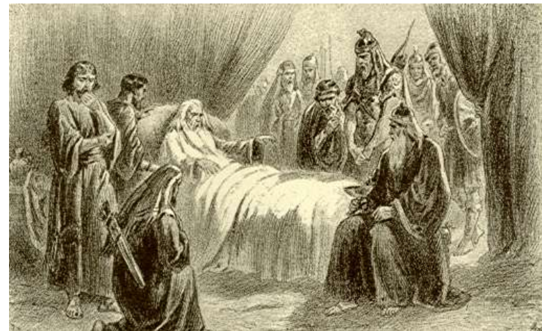
THE LAST CHARGE OF MATTATHIAS.

The old man's health had been failing for some time. The hardships of his new life had told grievously upon it, all the more that he refused the exemption from labour which his age required. He had ceased to accompany the expeditions because he found that his presence hampered the movements of younger and stronger men, but the management of the multifarious affairs of the encampment—the home administration, as it may be called, of the patriotic movement—he kept in his own hands. Early and late he busied himself in this work, and before many weeks were past his labours wore him out.