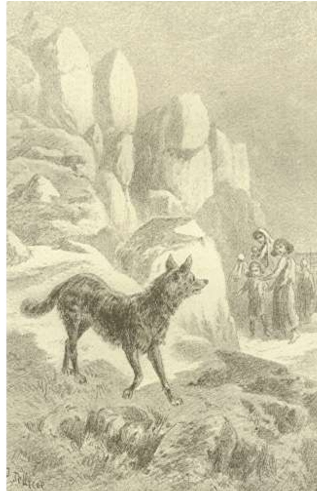
FAREWELL TO THE MOUNTAINS.

The next day Judas and his army, richly laden with spoils of every kind, returned to the sanctuary among the hills.