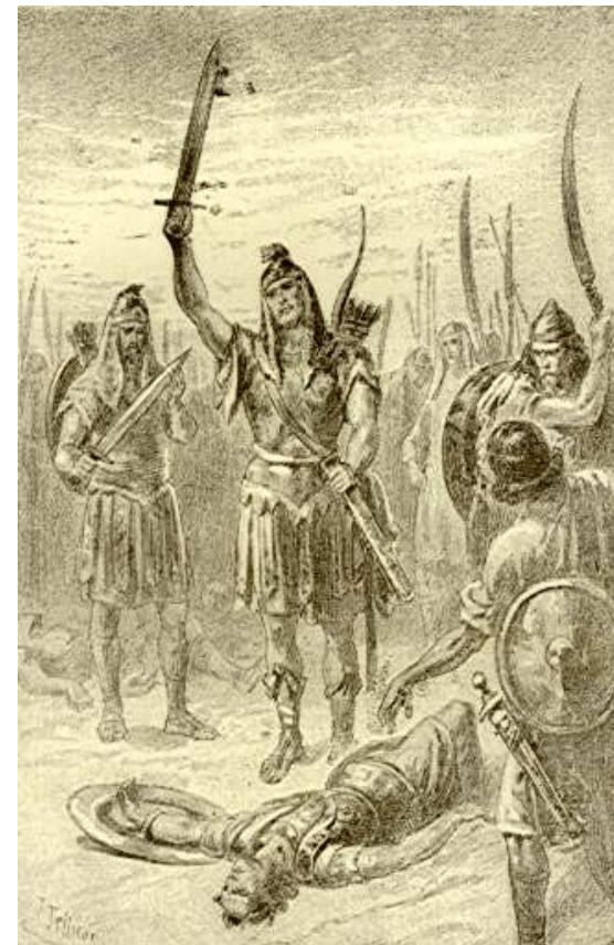
THE SWORD OF APOLLONIUS.

He gave back the consecrated sword to Azariah, and took the weapon which was still grasped in the right hand of the dead Apollonius. "With this," he said, "I will fight as long as I live." And he broke out into the triumphal chant of the Psalmist—"The ungodly have drawn out the sword, and have bent the bow to cast down the poor and needy. Their sword shall go through their own heart and their bow shall be broken."