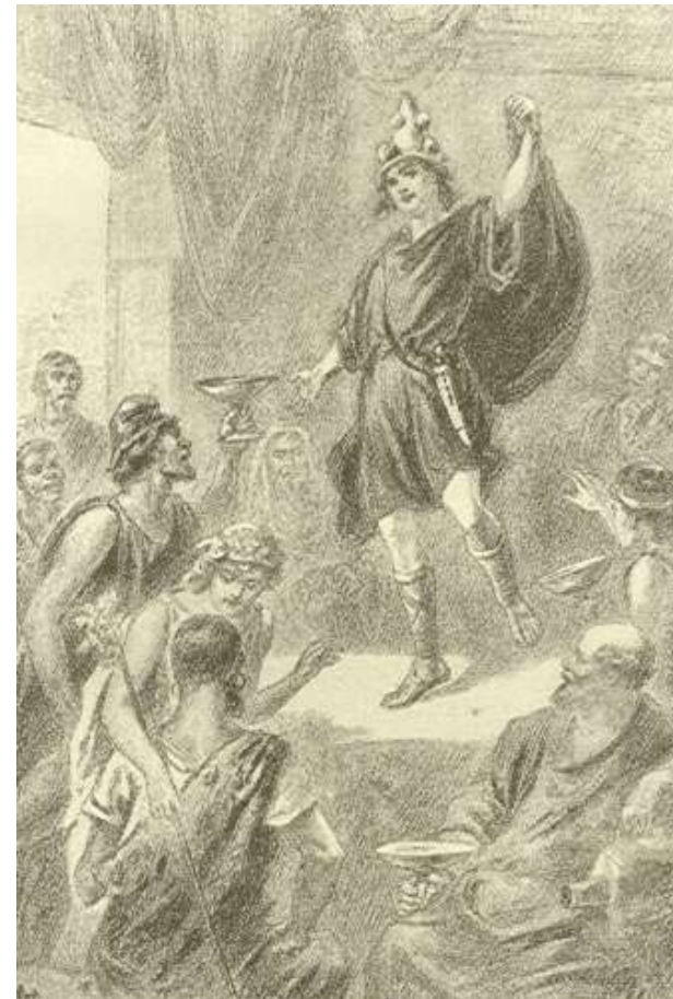
ANTIOCHUS IN THE TAVERN.

them in return by draining, a cup of a royal size. This was a final effort. He spoke a few hesitating sentences, frequently interrupted by hiccoughs, staggered, and but for the prompt attention of his attendants, who had indeed observed his condition, would have fallen to the ground. Nothing remained but to carry him out of the banqueting hall.