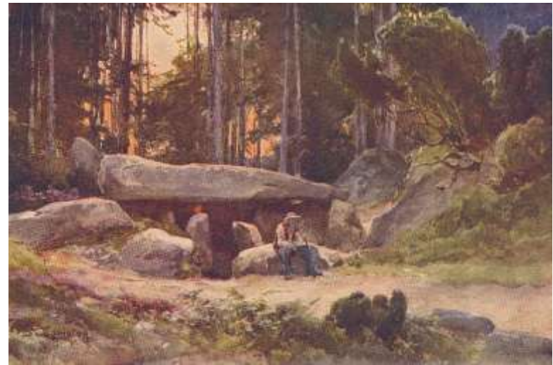
DOLMEN IN A GERMAN FOREST A BURIAL-PLACE OF AN ANCIENT GERMAN CHIEF.

trembled at sight of the Gothic horde, and begged for peace. Alaric offered peace, but it must be paid for, and he demanded so vast a ransom for the safety of the city that the Romans were aghast. "What should we have left?" they cried. "Your life," was the grim answer of the Goth.