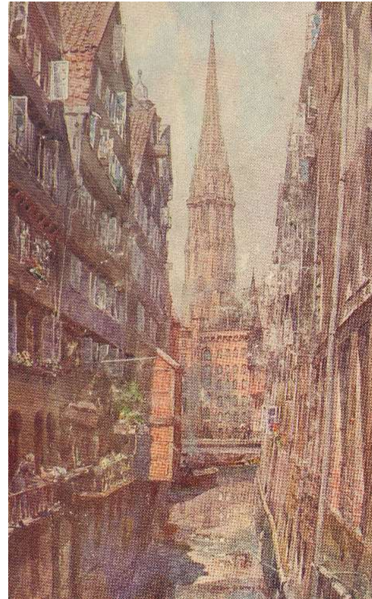
A WATER-STREET OF HAMBURG.

every destroying horde being marked by blazing towns and villages, and heaps of slaughtered country folk.