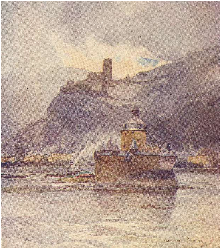
KAUB AND PALATINE CASTLE ON NEW YEAR'S EVE, 1813, GERMAN TROOPS UNDER FIELD-MARSHAL BLUCHER HERE CROSSED THE RHINE IN PURSUIT OF THE FRENCH ARMY.

On his side Napoleon collected a fresh army, but though its numbers were great, the new levies were, for the most part, raw boy's, young and poorly trained: he had left vast numbers of his former veterans beneath the Russian snows. Still he marched into Germany and beat the allied armies of Prussia and Russia in May 1813, and tried to win over Austria to his side. This attempt failed, and shortly Austria came into the field against him, and a last great struggle in Germany was joined.