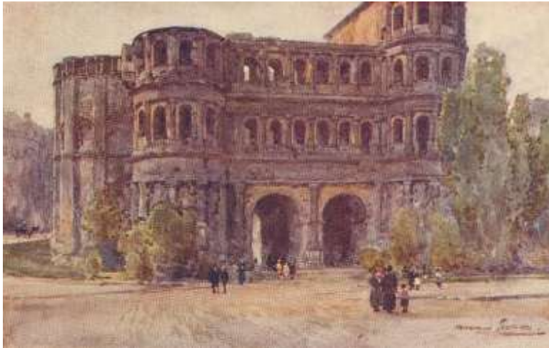
THE BLACK GATE AT TREVES BUILT BY THE ROMANS WHEN THEY WERE MASTERS OF GAUL.

the Hungarians were routed with such terrible slaughter that but few of them escaped from the field. This was in 933, and in 936 Henry I died, and was followed by his son, Otto I.