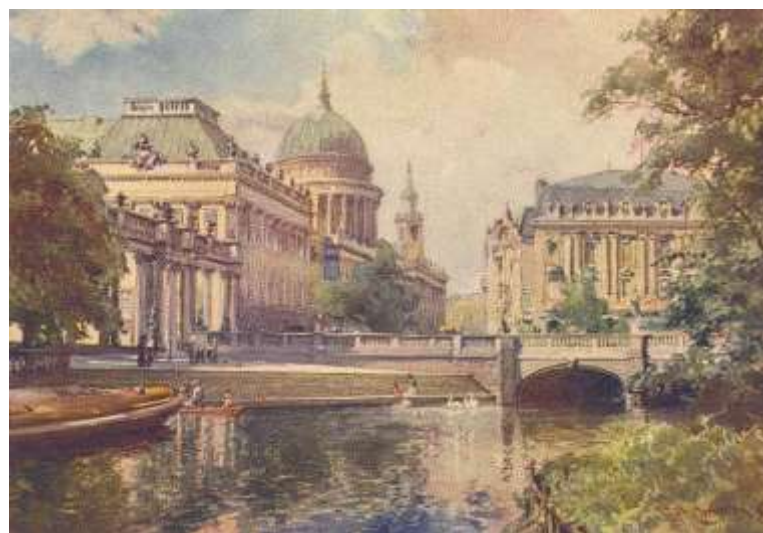
IMPERIAL PALACE AT POTSDAM.

In 1864 Austria and Prussia worked together for the last time. The Schleswig-Holstein question came up again, and Austria and Prussia attacked Denmark and took these duchies from her. A quarrel now arose between Prussia and Austria with regard to the government of Schleswig-Holstein, and was carried to a great height. It was a small matter, but it served as an outlet for the bitterness with which the rivals looked upon each other: the real cause lay behind the trivial dispute—it was the struggle for the leadership of Germany.