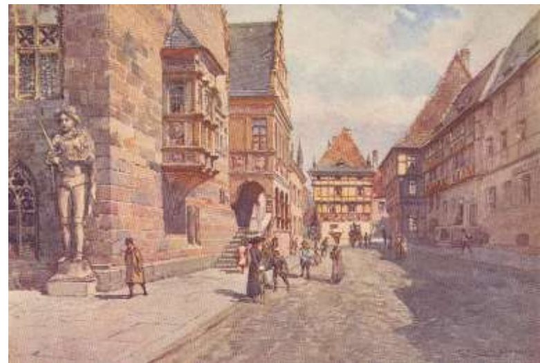
STREET AND TOWN HALL IN HALBERSTADT THE GIGANTIC FIGURE REPRESENTS THE ROLAND, THE MOST CELEBRATED OF THE PALADINS OF CHARLEMAGNE.

when Frederick banished him from the Empire. Next Frederick turned on the robber barons who had set up their castles on the heights beside the high roads and on the banks of rivers. From these strongholds the lawless nobles pounced on merchants and travellers, plundering the mule-trains or seizing the laden ships, and holding their captives to ransom. Frederick assailed these dens of thieves and beat the castles to the ground and put many of the robber barons to death, to the great joy of all peaceful people.