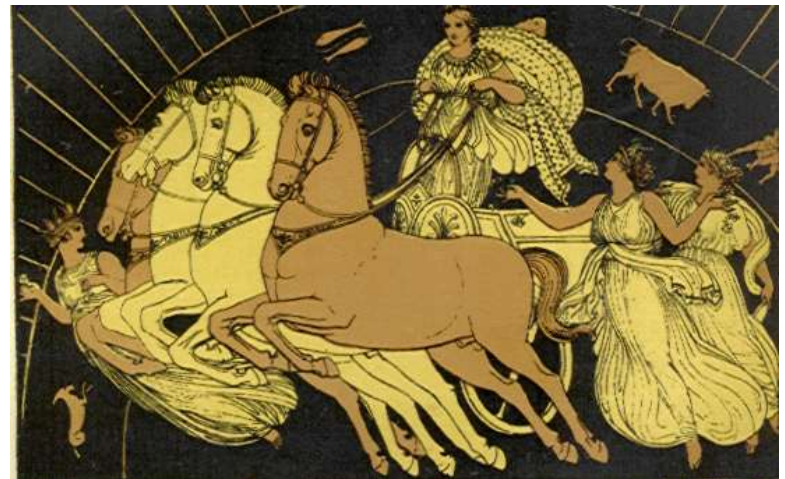
THE HORSES OF THE MORNING.

circle round about them drave against them right skilfully; and many hulls were overset, till a man could not see the sea, so full was it of wrecks and of bodies of dead men, with which also all the shores and rocks were filled. Then did all the fleet of the Persians take to flight without order, and our enemies with oars and pieces of wreck smote us, as men smite tunnies or a shoal of other fish; and there went up a dreadful cry, till the darkness fell and they ceased from pursuing. But all the evils that befell us I could not tell, no, not in ten days; only be sure of this, that never before in one day died such a multitude of men."