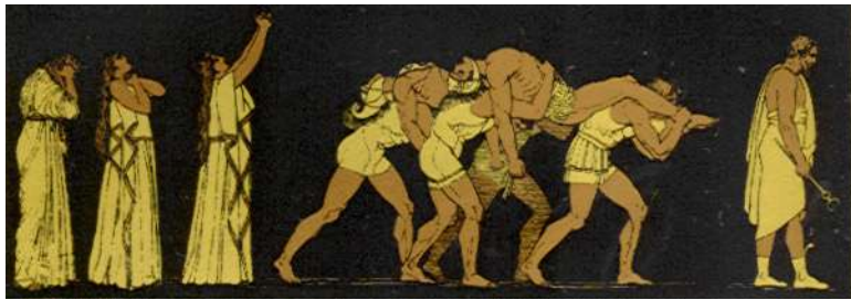
THE DEAD BROTHERS.

and came yet closer together. But Eteocles used a device which he had learnt in the land of Thessaly; for he drew his left foot back, as if he would have ceased from the battle, and then of a sudden moved the right forward; and so smiting sideways, drove his sword right through the body of Polynices. But when thinking that he had slain him he set his weapons in the earth, and began to spoil him of his arms, the other, for he yet breathed a little, laid his hand upon his sword, and though he had scarce strength to smite, yet gave the King a mortal blow, so that the two lay dead together on the plain. And the men of Thebes lifted up the bodies of the dead, and bare them both into the city.