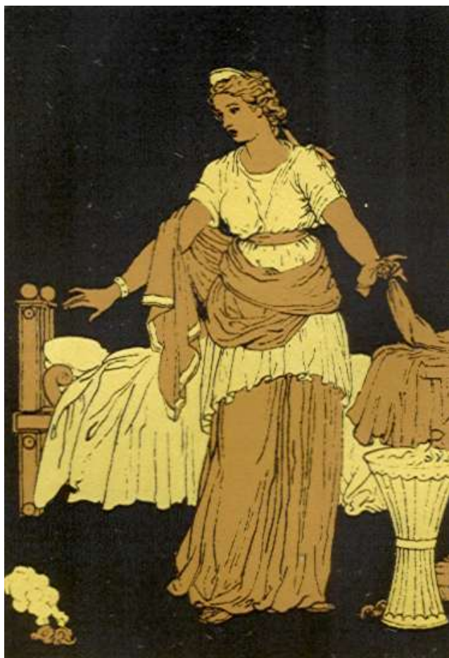
THE BURNING WOOL.

And she had scarce finished these words when Hyllus her son came in great haste; and when he saw her, he cried, "O my mother! would that I had found thee dead, or that thou wert not my mother, or that thou wert of a better mind than I know thee to be of."