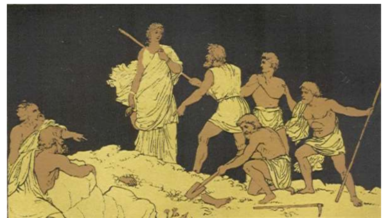
ANTIGONE AND THE BODY OF POLYNICES.

So the guard departed; but as he went he said to himself, "Now may the Gods grant that the man be found; but however this may be, thou shalt not see me come again on such errand as this, for even now have I escaped beyond all hope." Notwithstanding, after a space he came back with one of his fellows; and they brought with them the maiden Antigone, with her hands bound together. And it chanced that at the same time King Creon came forth from the palace. Then the guard set forth the thing to him, saying, "We cleared away the dust from the dead body, and sat watching it. And when it was now noon, and the sun was at his height, there came a whirlwind over the plain, driving a great cloud of dust. And when this had passed, we looked, and lo! this maiden whom we have brought hither stood by the dead corpse. And when she saw that it lay bare as before, she sent up an exceeding bitter cry, even as a bird whose young ones have been taken from the nest. Then she cursed them that had done this deed; and brought dust and sprinkled it upon the dead man, and poured water upon him three times. Then we ran and laid hold upon her, and accused her that she had done this deed; and she denied it not. But as for me, 'tis well to have escaped from death, but it is ill to bring friends into the same. Yet I hold that there is nothing dearer to a man than his life."