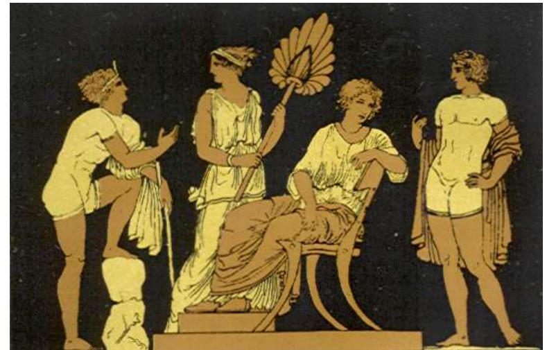
IPHIGENEIA AND ORESTES.

who was brought captive to this place wrote for me, pitying me, for he knew that I caused not his death, but the law of the goddess in this place. Nor have I yet found a man who should carry this thing to Argos. But thou, I judge, art of noble birth, and knowest the city and those with whom I would have communication. Take then this tablet, and thy life as a reward; and let this man be sacrificed to the goddess."