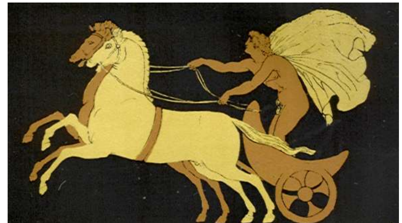
THE CHARIOT RACE.

Crissa was covered with broken chariots as the sea with shipwrecks. But the man of Athens was very skilful in driving, and, when he saw the beginning of confusion, he drew his horses aside and held back, and so escaped without damage. Now Orestes was the hindermost of all, trusting to what he should do at the end; and when he saw that only the man of Athens was left, he shouted to his horses and made haste to come up with him. Then the two drave together, having their chariots equal, and first one showed somewhat in the front and then the other. And for eleven courses of the twelve all went well with Orestes; but as he was rounding the pillar for the last time, he loosed the left rein and knew not that he loosed it overmuch, and smote against the pillar and brake his axle in the midst, and so was thrown out of his chariot; but the reins were tangled about him and held him. And all the people cried aloud when they saw the young man dragged over the plain. But at last they that had driven the other chariots hardly stayed the horses, and loosed him. Covered with blood was he and sorely mangled, that none could have known him. And we burnt his body; and certain Phocians, whom the Prince hath sent for this purpose, bring that which remaineth of him, being but a few ashes in an urn of brass, for all he was so tall and strong. This is a sad tale for thee to hear; but for us who saw it never was anything in this world more grievous."