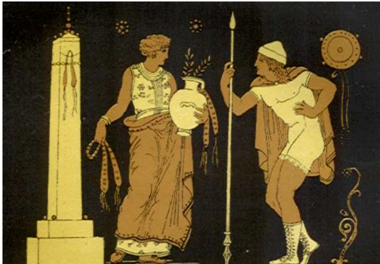
ELECTRA AND ORESTES.

Then Orestes made reply, " 'Tis well said, old man. Harken then to what I purpose. And first know that when I would hear from Apollo at his oracle in Delphi how I should best avenge my father, he bade me trust neither in shield nor spear, but accomplish the deed by craft. Do thou then go when occasion shall offer into the palace, and spy out the things that are therein. For they will not know thee who thou art, so changed art thou. And thou shalt tell them such a tale about me as shall surely deceive them. And we meanwhile will do honor to the spirit of my father at his grave, offering hair that has been shorn from my head and drink offerings, and afterwards will return and accomplish what shall remain to be done."