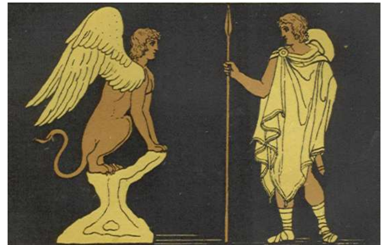
OEDIPUS AND THE SPHINX.

It befell in times past that the Gods, being angry with the inhabitants of Thebes, sent into their land a very noisome beast which men called the Sphinx. Now this beast had the face and breast of a very fair woman, but the feet and claws of a lion; and it was wont to ask a riddle of such as encountered it; and such as answered not aright it would tear and devour. Now when it had laid waste the land many days, there chanced to come to Thebes one Cædipus, who had fled from the city of Corinth that he might escape the doom which the Gods had spoken against him. And the men of the place told him of the Sphinx, how she cruelly devoured the people, and that he who should deliver them from her should have the kingdom. So Cædipus, being very bold, and also ready of wit, went forth to meet the monster. And when she saw him she spake, saying—