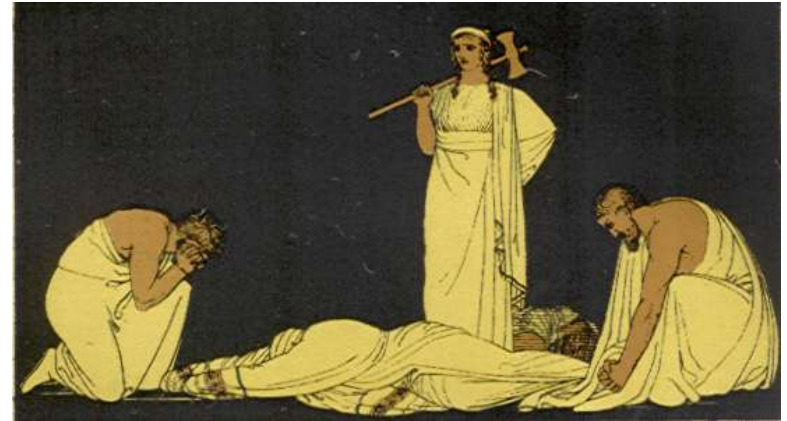
THE MURDER OF AGAMEMNON.

thrown back and there appeared a dreadful sight—two dead bodies, covered each with a veil, and the Queen, with an axe in her hand, standing beside them, who said—