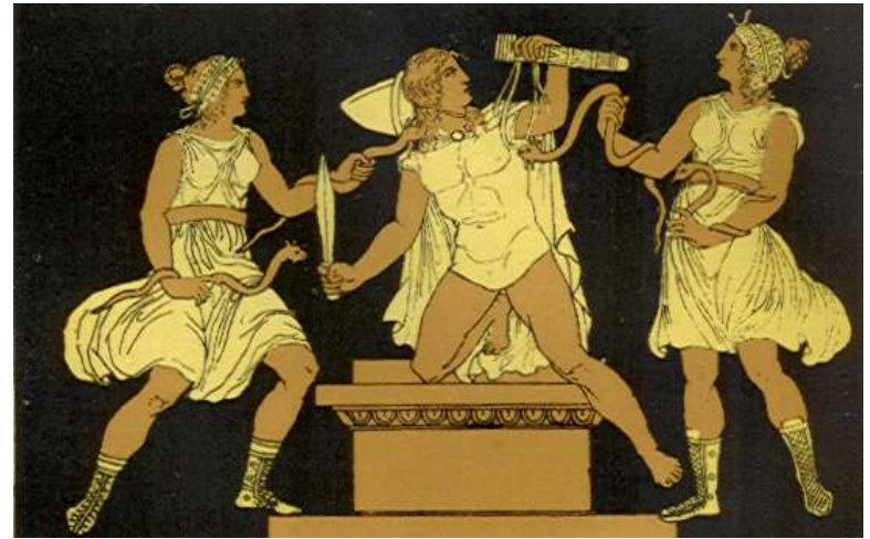
ORESTES AND THE FURIES.

To her Orestes answered, "What meanest thou, lady, by lamenting in this fashion over us? I hold it folly in him who must die that he should bemoan himself. Pity us not; we know what manner of sacrifices ye have in this land."