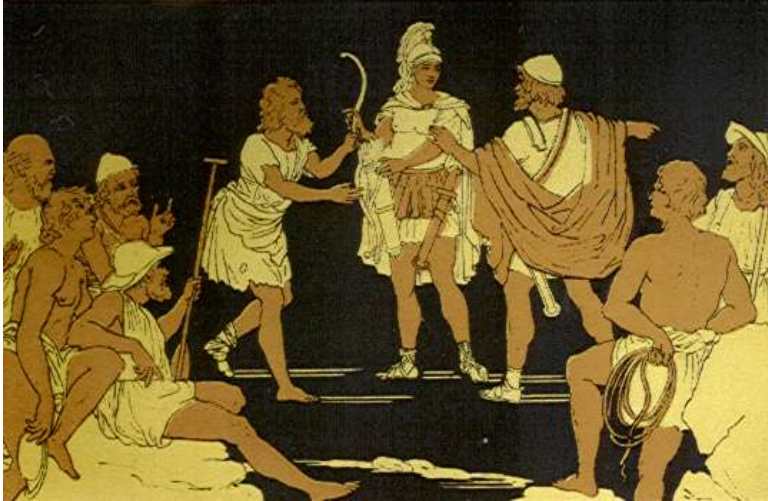
THE REPENTANCE OF NEOPTOLEMUS.

But while they thus talked together, the Prince came back like one that is in haste, with Ulysses following him, who cried, "Wherefore turnest thou back?"