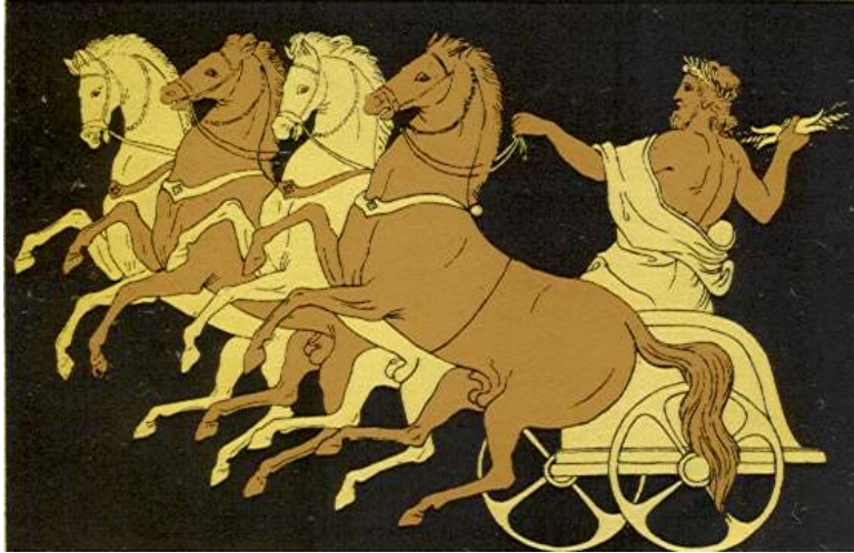
THE CHARIOT OF ZEUS.

their mistress, nor did she fail to reach her hand to each of them, greeting him. There was not one of them so vile but she spake to him and was spoken to again.