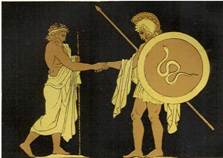
PELIAS SENDING FORTH JASON.

in the ship, and so departed. But when Jason was come to the land of Iolcos, Pelias was not willing to keep his promise that he would give the kingdom to him. Whereupon Medea devised this thing against him. She took a ram, and cut him in pieces, and boiled his flesh in water, putting herbs into the caldron, and saying divers enchantments over it; and, lo! the beast came forth young, though it had been very old. Then she said to the daughters of Pelias, "Ye see this ram, how he was old, and I have made him young by boiling him in water. Do ye so likewise to your father, and I will help you with drugs and enchantments, as I did with the ram." But she lied unto them, and helped them not. So King Pelias died, being slain by his daughters, when they thought to make him young. But the people of the land were very wroth with Medea and with Jason her husband, and suffered them not to dwell there any more. So they came and dwelt in the land of Corinth. Now when they had abode there many days, the heart of Jason was turned away from his wife, and he was minded to put her away from him, and to take to himself another wife, even Glauké, who was daughter to Creon, the King of the city.