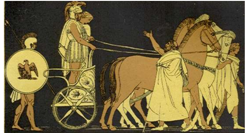
THE RETURN OF AGAMEMNON.

"And did men judge of him as living or dead?"