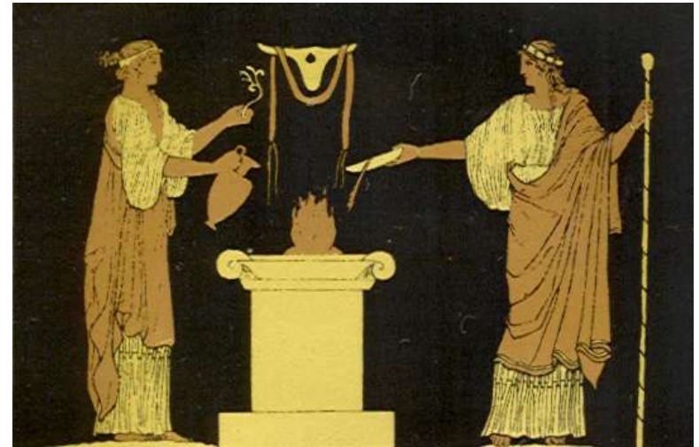
OFFERINGS TO THE DEAD.

an offering to her gods; and I charge thee that thou leave not my sister, but be faithful to her. And now farewell, true friend and companion in my toils; for indeed I die, and Phœbus hath lied unto me, prophesying falsely."