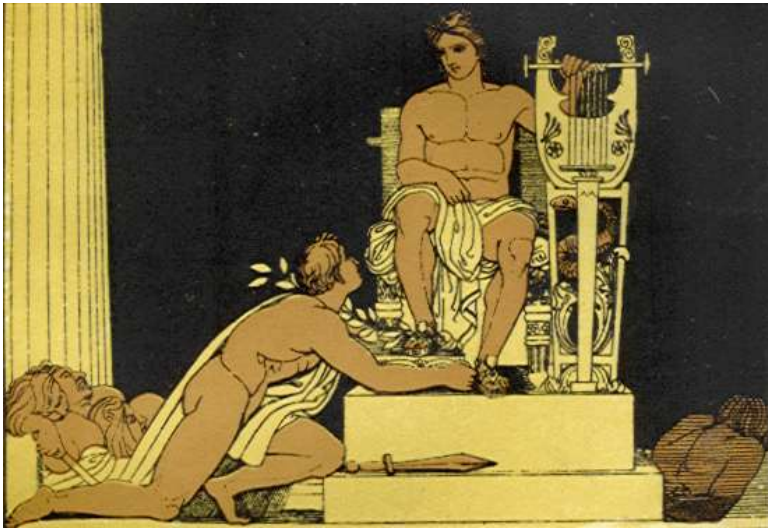
ORESTES SUPPLIANT TO APOLLO.

Then they began to stir and rouse themselves, the spirit still goading them with angry words till they were now fully awake and ready to pursue. Then there appeared the God Apollo with his silver bow in his hand, and cried, "Depart from this place, ye accursed ones. Depart with all speed, lest an arrow leap forth from this string and smite you so that ye vomit forth the blood of men that ye have drunk. This is no fit halting-place for you; in the habitations of cruelty is your best abode, or in some lion's den, dripping with blood, not, verily, where men come to hear the oracles of truth. Depart ye, therefore, with all speed."