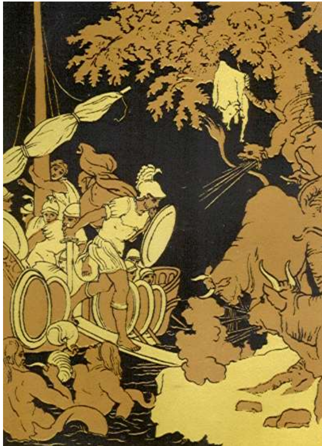
THE FIRE-BREATHING BULLS.

And the King said, "Hear this, Medea. I bid thee depart out of this land, and thy children with thee. And I am come myself to execute this word, for I depart not again to my own house till I have cast thee forth from my borders."