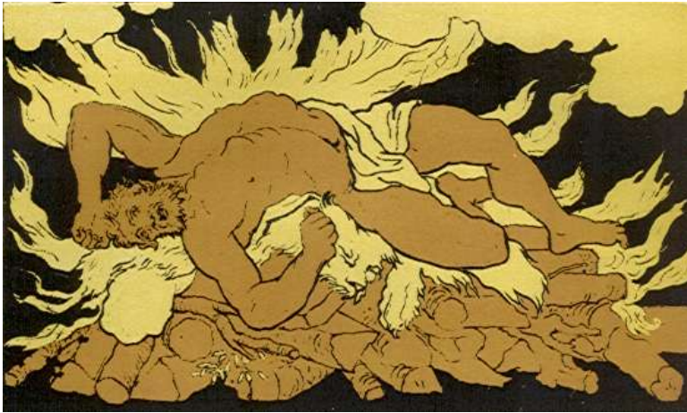
HERCULES ON MOUNT OETA.

"O my marriage-bed, where never more I shall lie, farewell!" And as she spake she loosed the golden brooch that was upon her heart, and bared all her left side; and before any could hinder her—for her nurse had seen what she did, and had run to fetch her son—she took a two-edged sword and smote herself to the heart, and so fell dead. And as she fell there came her son, that now knew from them of the household how she had been deceived of that evil beast the Centaur, and fell upon her with many tears and cries, saying that now he was bereaved both of father and of mother in one day.