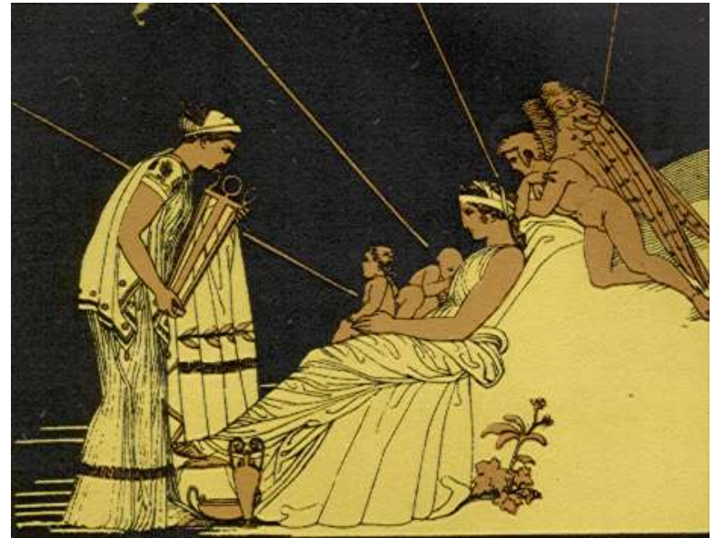
THE BIRTHDAY GIFTS OF PHOEBUS.

and over the land; but do thou not grow weary or faint, but haste to the city of Pallas, and sit in the temple of the goddess, throwing thy arms about the image, and there will I contrive that which shall loose thee from this guilt."