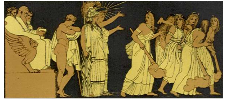
THE FURIES DEPARTING.

rise, ye judges, from your place, and take these pebbles in your hand, and vote according to right, not forgetting your oath."