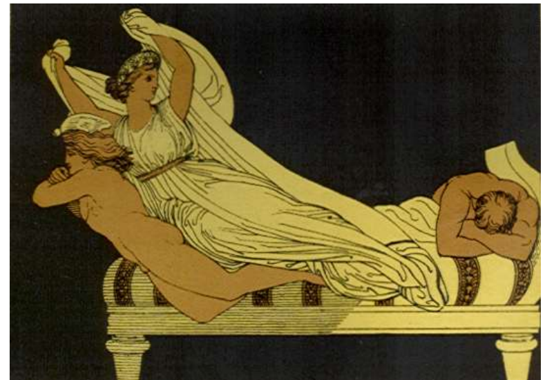
"THE EMPTY JOY THAT DWELLS IN THE DREAMS OF THE NIGHT."

in the net of destruction! Long since did Zeus bend the bow and make it ready against the transgressor, and now hath the arrow sped to the mark! Evil was the day when Paris shamed the table of his host, stealing the wife of his bosom! Evil the hour when she went, as one that goeth lightly and carelessly, through the gates of Troy, and brought with her the dowry of destruction and death. Sorrow she left behind her in her home; the desolate couch and the empty hall, for here, the grace of the shapely statues mocked her husband's grief with the stony stare of their loveless eyes, and there, but the empty joy remained that dwells in the dreams of the night. Aye! and a sorrow she left that was greater than this. For the heroes went forth from the land of Greece, valiant and wise and true; and lo! all that Ares, the changer, but not of money, sendeth back is a handful of ashes shut in an urn of brass! Therefore there is wrath in the city against the sons of Atreus, the leaders of the host; nor does the vengeance of the Gods forget the shedder of blood."