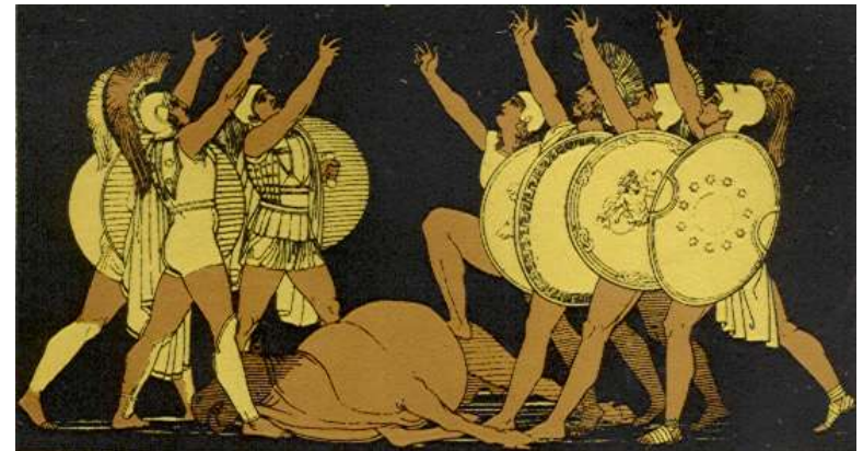
THE OATH OF THE SEVEN CHIEFS.

against it many days, and yet had prevailed nothing, Adrastus held a council of the chiefs, and it was agreed that next day, early in the morning, they should assault the city with all their might. And when the morning was come, the chiefs were gathered together, being seven in number. And first of all they slew a bull, and caught the blood of the beast in the hollow of a shield, into which they dipped their hands, and swore a great oath that they would take the city of Thebes or die. And having sworn, they hung upon the chariot of Adrastus what should be memorials of them, each for his own father and mother, all weeping the while. After this they cast lots for the, places which they should take, for there were seven gates to the city, that each chief might assault a gate.