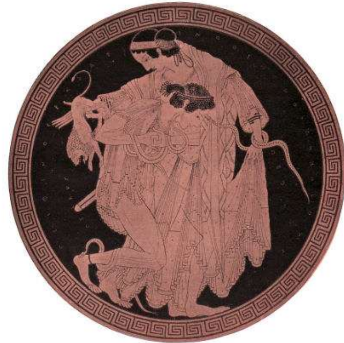
PELEUS WRESTLES WITH THETIS.

Yet his heart did not wholly fail him, though the panther snarled fearsomely and drove its sharp claws into his side. As blood-drops from the wound fell on the panther's glossy fur, Peleus could feel it tremble; for one instant it lay still in his arms, and in that instant he cried once more, "Speak to me, Thetis!" but now it gave a spring that well-nigh made him lose his hold, and he tripped over a stone and fell headlong. Furiously struggled the panting beast as they rolled upon the sand, hither and thither it dragged him while still he held on grimly, setting his teeth and straining every muscle in a last despairing effort. Its form seemed to swell and change colour before his failing eyes; surely now it was a huge tawny thing he fought with, and his fingers were locked in a shaggy mane! All at once the hollow roar of a