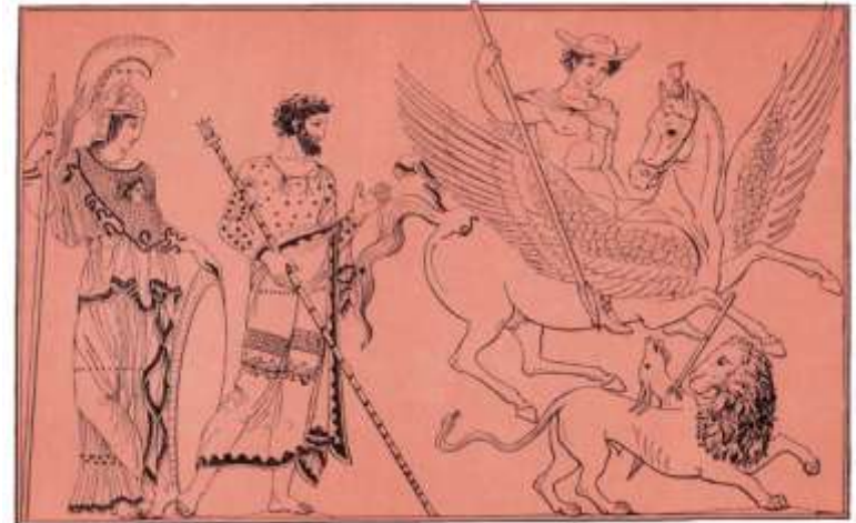
PEGASUS AND HIS RIDER.

ran to the beautiful, prancing beast to seize him by the mane, but the First Horse had wings, and straightway he soared aloft and passed from sight. Then Athena took Medusa's head and fixed it in the centre of her shield, and she covered it with her veil. "Take this home with you," she said to Perseus, "and use it as you shall see need, but remember that to look on it is death."