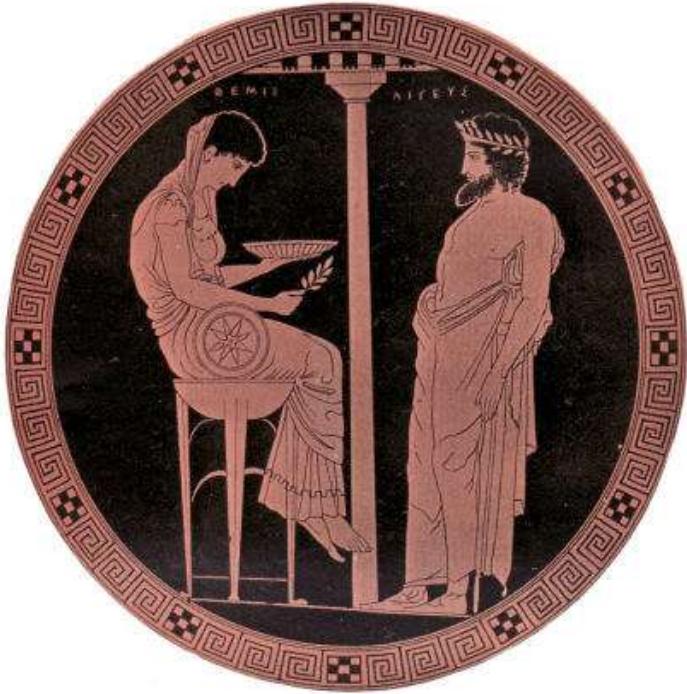
THE KING CONSULTS THE DELPHIC ORACLE.

into a trance and chants divine words of prophecy or counsel, according as Apollo wills her to give his answer.