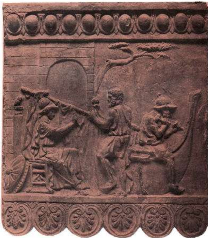
BUILDING THE ARGO.

It were long to tell what other heroes of ancient story mustered in Jason's hall that day, but none were so wondrous to behold as the last comers, Zetes and Cala?s, sons of the North Wind, who had bright feathered wings waving from their shoulders.