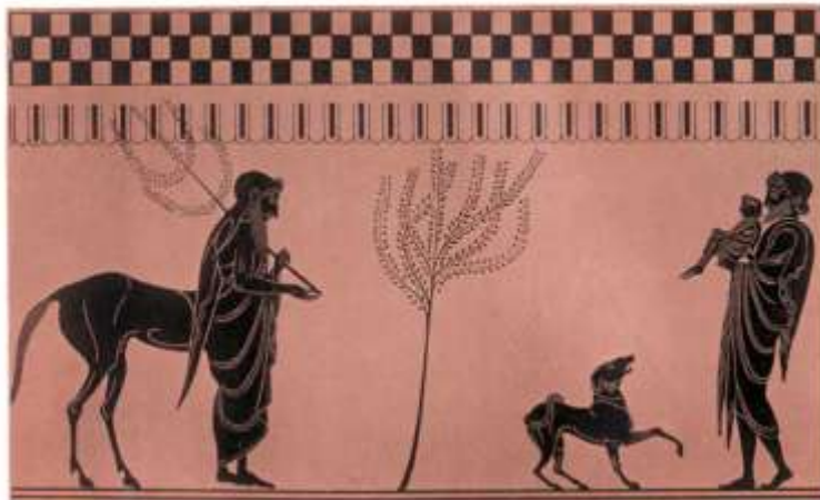
THE CHILD ACHILLES BROUGHT TO CHIRON.

King's halls. She told me at the beginning that she must leave me for ever the first time I crossed her in anything, for such, she said, is the way of all the sea-people. And when the babe was born, I woke one night and saw her steal out of our chamber carrying it in her arms, and I followed her, to see what she would do. She went into the hall, where the fire still burned on the hearth, and there, horror-stricken, I saw her thrust the child into the glowing embers. Who could see that and not do as I did? Yet the reproachful look Thetis gave me, as I snatched the babe from her, pierced me to the soul. 'Did I not warn you,' she said, 'never to cross me? Had you not hindered, I would have made the child weapon-proof from head to heel by the power of flame. But I must leave that word undone. Farewell, farewell!' With that, quick as a lightning-flash, she darted from the hall and from the palace, and flung herself into the sea."