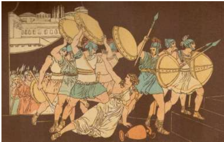
THE DEATH OF TARPEIA.

oak that stood thereon in those days. And when he had measured out the length and breadth of a temple that he would build to Jupiter upon the hill, he said, "O Jupiter, I, King Romulus, offer to thee these arms of a King, and dedicate therewith a temple in this place, in which temple they that come after me shall offer to thee like spoils in like manner, when it shall chance that the leader of our host shall himself slay with his own hands the leader of the host of the enemy." And this was the first temple that was dedicated in Rome. And in all the time to come two only offered in this manner, to wit, Cornelius Cossus that slew Lars Tolumnius, king of Veii, and Claudius Marcellus that slew Britomarus, king of the Gauls.