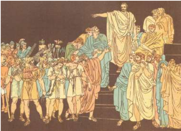
BRUTUS CONDEMNING HIS SONS TO DEATH.

the conspirators were brought to judgment, and being condemned, suffered death, being first beaten with rods and then beheaded. Now the Consuls' office was that, sitting in their seats, they should see sentence executed on evil doers. And this they did, nor did Brutus turn away from his duty, for all that his own sons were done to death before his eyes, but sat in his place, seeing that all things were done according to the law. As for the slave that bare witness against the conspirators, he had freedom and citizenship for his reward.