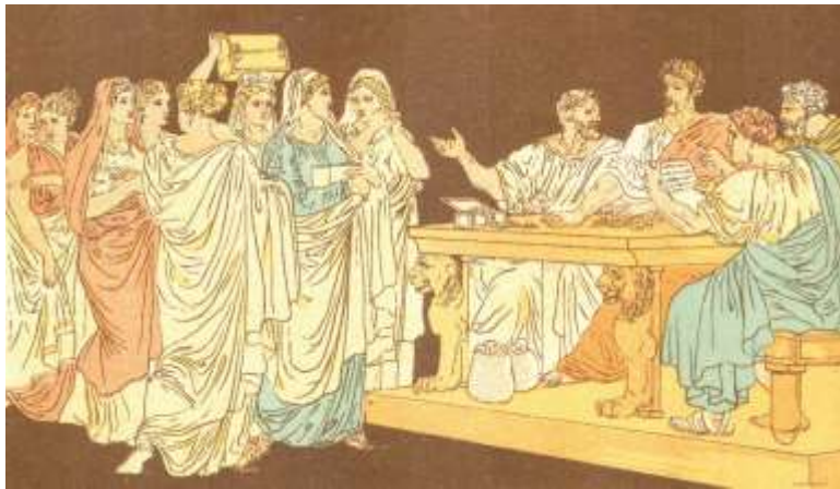
ROMAN LADIES BRINGING THEIR ORNAMENTS.

tenth of all that before the uttering of the vow belonged to the men of Veii, and afterward came into the power of the Roman people." Thus the city and the lands thereof were included. The money, therefore, was paid out of the public treasury; and the magistrates were commanded to purchase gold therewith. And when there was not found a sufficient quantity of this metal, the matrons, having first met and deliberated on the matter, promised that they would themselves supply the magistrates with gold, and carried all their ornaments to the treasury. Never was anything done that more pleased the Senate than this liberality of the women; and, by way of recompense, it was ordered that they should thereafter enjoy this privilege, that they should use covered chariots whensoever they went to public worship or to the games, and other carriages on any day, whether festival or common. Notwithstanding, the tribunes of the Commons were still bitter against Camillus. "Verily," they said, by his confiscations and consecrations he hath brought the spoil of Veii to nothing."