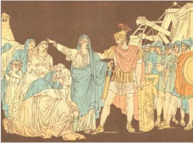
THE MOTHER OF CORIOLANUS PLEADS WITH HER SON.

And when the ambassadors were sent a second time he would not suffer them to enter the camp. After them came the priests, bearing the emblems of their office; nor did these prevail more than the ambassadors. Then a great company of the women came to Veturia, the mother of Coriolanus, and to Volumnia, that was his wife. But whether they did this by consent of the rulers, or by prompting of their own fear, cannot be affirmed for certain. These women then prevailed with Veturia, though she was now well stricken in years, and with Volumnia, that they should go to the camp to Coriolanus; and Volumnia carried with her the two sons that she had borne to Coriolanus. These having come, it was told the man that a great company of women was arrived. At the first, indeed, he was not minded to yield to their tears that which he had steadfastly refused to the ambassadors. But afterward, when a certain one of his friends, seeing Veturia stand together with her daughter-in-law and grandsons, said, "Unless my eyes deceive me, thy mother and wife and children are here."