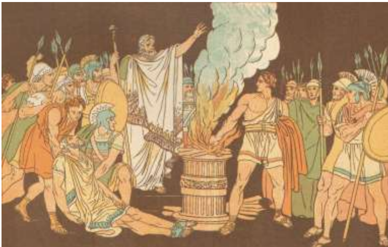
MUCIUS SCOEVOLA BEFORE LARS PORSENNA.

unless he should speedily reveal what that danger which he threatened against the King might be. Then said Mucius, "See now and learn how cheaply they hold their bodies that set great glory before their eyes," and he thrust his right hand into a fire that had been lighted for sacrifice. And as he stood and seemed to have no feeling of the pain, the King, greatly marvelling at the thing, leapt from his seat and bade them take away the young man from the altar. "Depart thou hence," he cried, "for I see that thou darest even worse things against thyself than against me. I would bid thee go on and prosper with thy courage wert thou a friend and not an enemy. And now I send thee away free and unharmed." Then said Mucius, as though he would make due return for such favor, "Hearken, O King; seeing that thou canst pay due respect unto courage, I will tell thee freely that which thou couldst never have wrung from me by threats. Three hundred youths of Rome have banded themselves together with an oath that they will slay thee as I would have slain thee. And because the lot fell to me I came first of the three hundred, who all will follow, each in his own time, according as the lot shall fall."