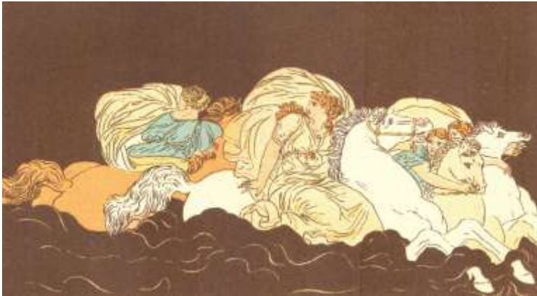
CLOELIA AND HER COMPANIONS.

will give thee," he said to her, "a certain portion of the hostages: thou shalt choose whom thou wilt." Then she chose such as were of tender age, not only because this best became the modesty of a maiden, but because such would be in the greater peril of harm. To her the Romans set up in the Sacred Road a statue, a maiden sitting on horseback—a new honor, even as the valor that was so honored was new also.