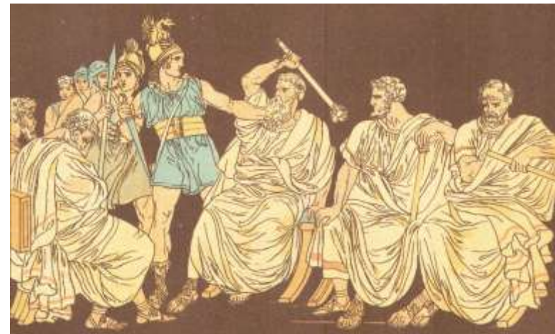
THE GAULS AND THE SENATORS.

riches. Thence again, terrified by the silence of the place, and fearing lest some stratagem of the enemy might be concealed thereby, they returned to the market-place and to the parts adjacent thereto. Here finding that the palaces of the nobles were open, and the houses of the common folk barred, they were slower to enter the open than the shut, for they beheld with no small reverence the men that sat each in the porch of his house, noting how great was the splendor of their apparel and their ornaments, and that the majesty of their countenances was rather that of gods than of men. So they stood marvelling at them as though they had been images of the gods, till a certain Marcus Papirius, one of the priests, smote a Gaul on the head with his ivory staff, the man having stroked his beard, which it was then the custom to wear of a great length. The barbarian in a rage slew him, and all the others also were slain where they sat. The nobles having thus perished, all others that were found in the city were slaughtered in like manner, the houses were plundered, and being emptied of their goods were set on fire.