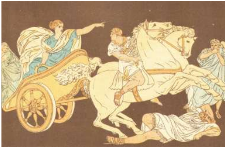
TULLIA DRIVING OVER THE BODY OF HER FATHER.

come, for some had been won over to the young man beforehand, and others feared that they should suffer harm if they came not, for the matter was altogether beyond their expectation; also they thought that King Servius had already perished. And when they were assembled, Tarquin sat down upon the throne and spake in some such fashion as this: "The slave that was the son of a slave-woman seized the kingdom when the King my father had been shamefully slain. Neither was there any assembly held for election; nor did the people give their votes for him, nor did the Senate confirm the matter. By none of these things doth he possess this great dignity, but by the bounty of a woman. And now he, being such an one as he is, favors the lowest of the people, to whom he divideth this land, which is of right the possession of the nobles; in like manner the burdens which at one time were borne in common by all, he putteth upon you; and this ordering of the citizens that he hath lately established, for what purpose is it but that he may know who hath aught, that he may make distribution to the needy?"