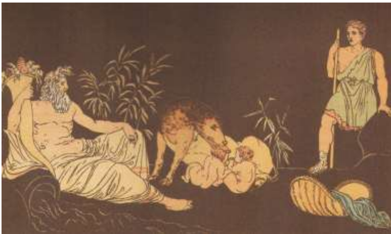
THE WOLF LAND THE TWINS.

Æneas of Troy, coming to the land of Italy, took to wife Lavinia, daughter of King Latinus, and built him a city, which he called Lavinium, after the name of his wife. And, after thirty years, his son Ascanius went forth from Lavinium with much people, and built him a new city, which he called Alba. In this city reigned kings of the house and lineage of Æneas for twelve generations. Of these kings the eleventh in descent was one Procas, who, having two sons, Numitor and Amulius, left his kingdom, according to the custom, to Numitor, the elder. But Amulius drove out his brother, and reigned in his stead. Nor was he content with this wickedness, but slew all the male children of his brother. And the daughter of his brother, that was named Rhea Silvia, he chose to be a priestess of Vesta, making as though he would do the maiden honor, but his thought was that the name of his brother should perish, for they that serve Vesta are vowed to perpetual virginity.