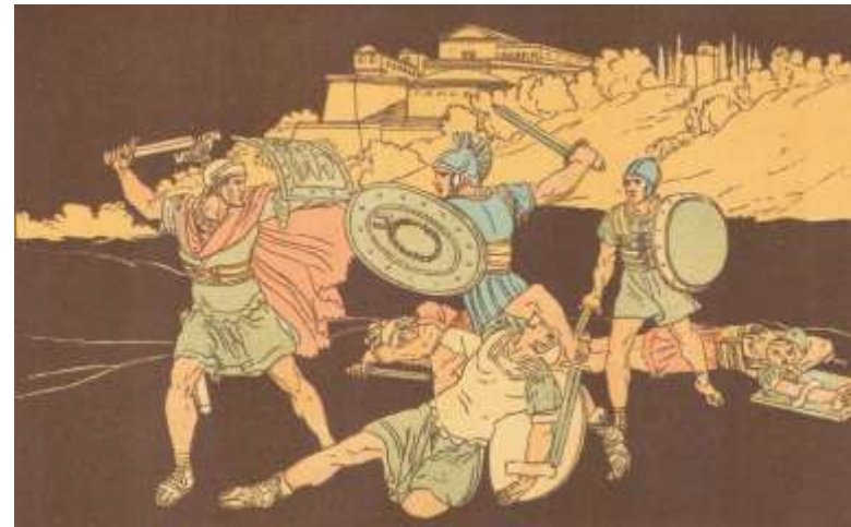
THE HORATTII AND THE CURIATTII.

Before the armies departed to their homes, Mettus of Alba inquired of Tullus what he would have him to do according to treaty. And the King answered, "Keep the young men under arms. I shall call for them if I have war against the men of Veii."