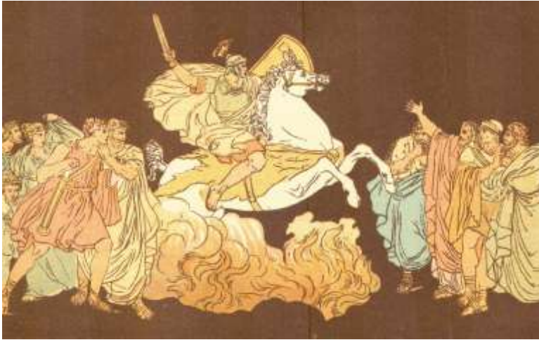
CURTIUS LEAPING INTO THE CHASM.

camp near to the marshes by the sea, over against the camp of the Gauls.