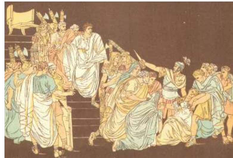
THE DEATH OF VIRGINIA

There went up a great cry from all that stood there when they saw so dreadful a deed, and Appius commanded that they should seize him. But no man laid hands on him, for he made a way for himself with the knife that he carried in his hand, and they that followed defended him, till he came to the gate of the city. Then Icilius and Numitorius took up the dead body of the maiden and showed it to the people, saying much of the wickedness of him who had driven a father to do such a deed, and much also of the liberty which had been taken from them, and which, if they would only use this occasion, they might now recover. As for Appius, he cried out to his lictors that they should lay hands on Icilius, and when the crowd suffered not the lictors to approach, would himself have made a way to him, by the help of the young nobles that stood by him.