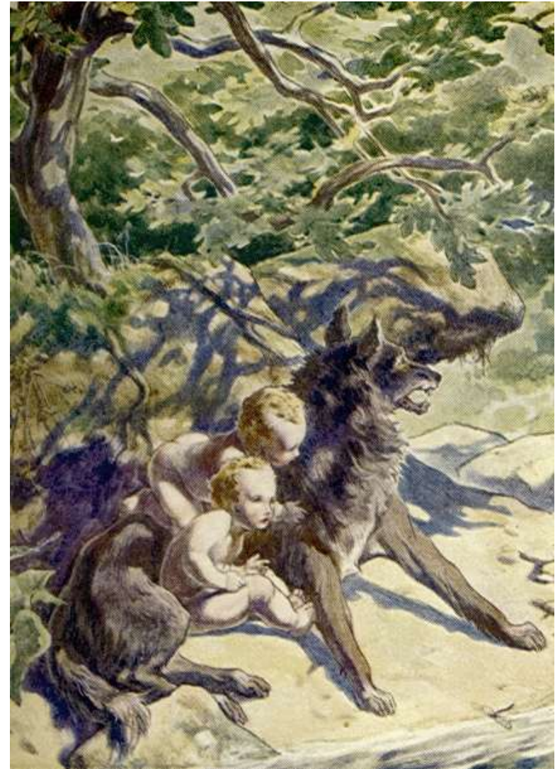
A she-wolf, coming to the edge of the river to drink, heard their cries.

It might be that the children of Numitor would some day wrench the crown from him, even as he had wrenched it from their father.