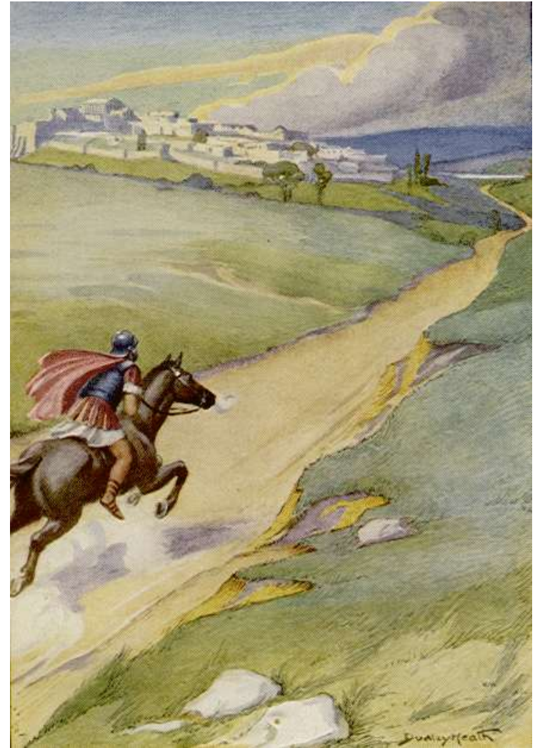
A messenger was seen spurring his horse toward the city.

As hope was changing into fear, a messenger was seen spurring his horse toward the city. When he rode in at the gates the people crowded round him to try to gather his tidings.