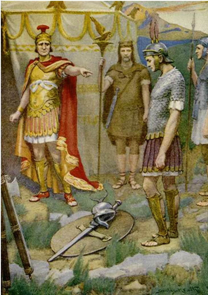
The youth laid the arms he had taken from his foe at his father's feet.

Flushed with victory, and thinking that his father would forgive his disobedience, the youth hastened to the tent of Torquatus, and laid the arms he had taken from his foe at his father's feet.