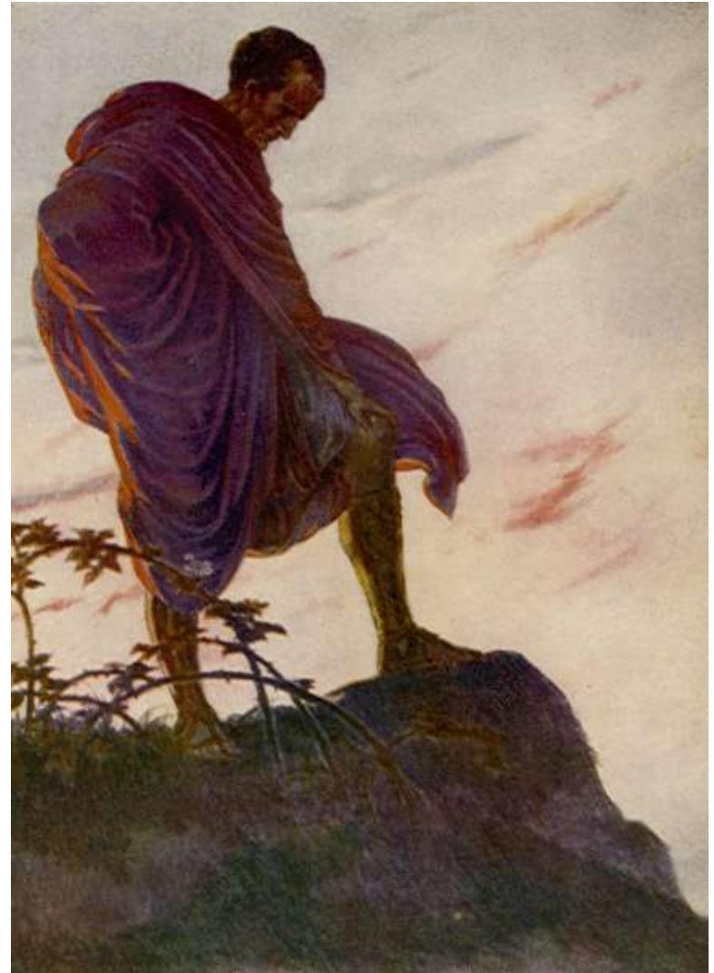
Looking down upon the stream, he stood awhile deep in thought.

Rubicon. The Rubicon was the stream which divided his province from Italy.