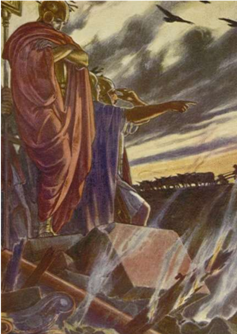
The city was given to the flames.

Fifty thousand men, women, and children, pale and haggard with all that they had gone through during the long drawn out siege, left the castle and were carried off as prisoners.