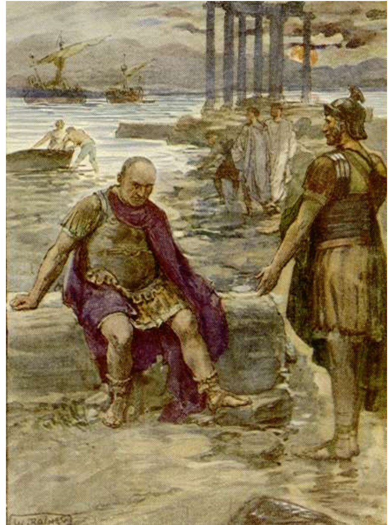
Gaius Marius sitting in exile among the ruins of Carthage.

After young Marius had listened to the tale of his father's adventures, he was sent to Hiempsal, King of Numidia, to beg for protection for his father and himself.