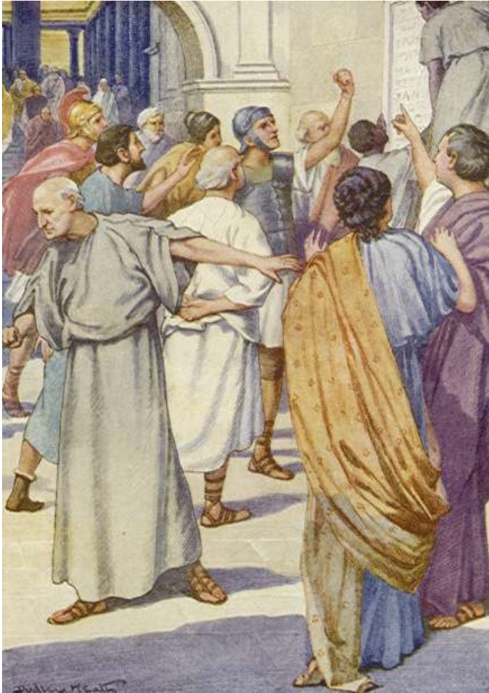
Lists of those who were doomed were hung up in the Forum.

The property of those who perished was forfeited, and in this way Sulla and his friends soon grew rich.