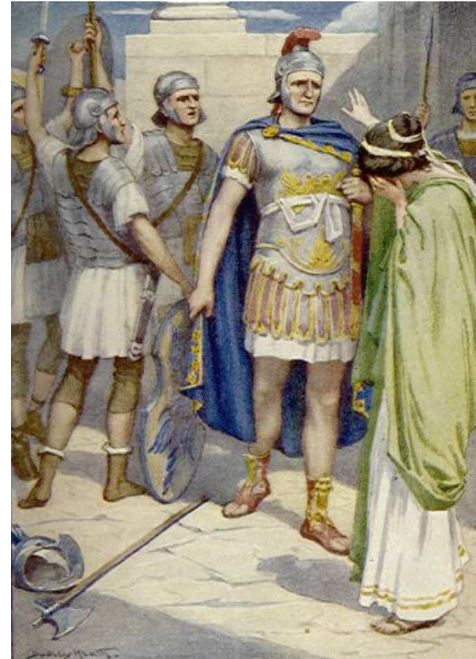
When she saw Horatius wearing on his shoulders the cloak of her betrothed, she broke into bitter sobs.

Then, to the dismay of the Roman army, Horatius, on whose courage the safety of Rome depended, turned and fled, pursued by the three wounded men.