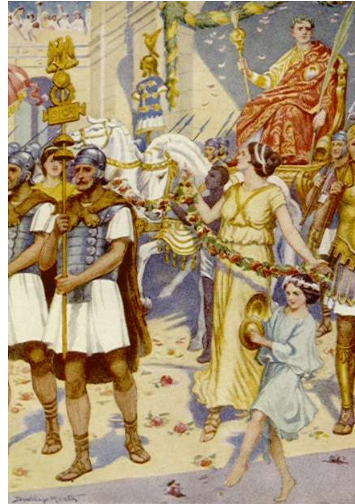
His progress was as that of a king.

When he reached Italy his progress was as that of a king. In towns and villages he was hailed as the deliverer of Rome. Had he not forced Hannibal to leave Italy, and had he not even defeated the bold conqueror of Cannæ?