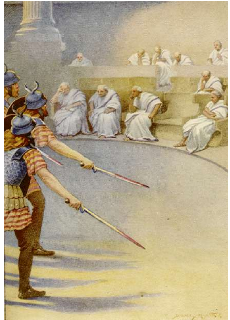
Seated in chairs of ivory, sat a number of strange, venerable old men.

likely to take it than before. And now their provisions were beginning to run short.