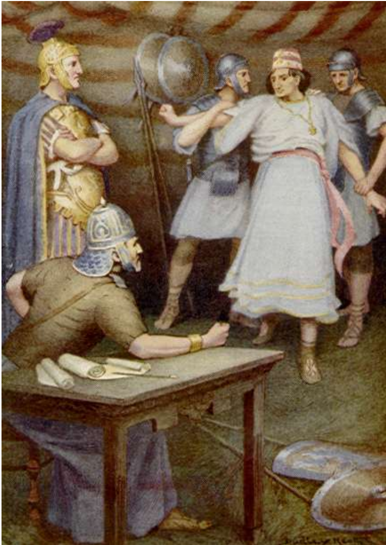
Jugurtha came to the tent of his father-in-law unarmed.

were secured. Sulla then ordered them to be taken to the Roman camp and delivered to Marius.