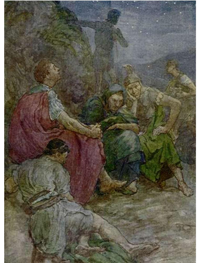
Here, sheltered by steep cliffs, he sat down to rest.

But Antony turned to the crestfallen horsemen and said, "You have brought me better booty than you sought. For indeed I am uncertain how I should have used Brutus if you had brought him alive, but of this I am sure, it is better to have such men as Lucilius our friends than our enemies." From that day Antony and Lucilius were friends.