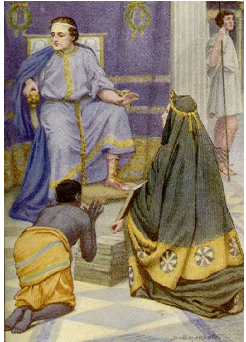
She carried in her arms nine books.

And the ambassadors were successful, for when they returned they brought with them new scrolls, which, when a new Capitol was built, were placed within its sacred precincts.