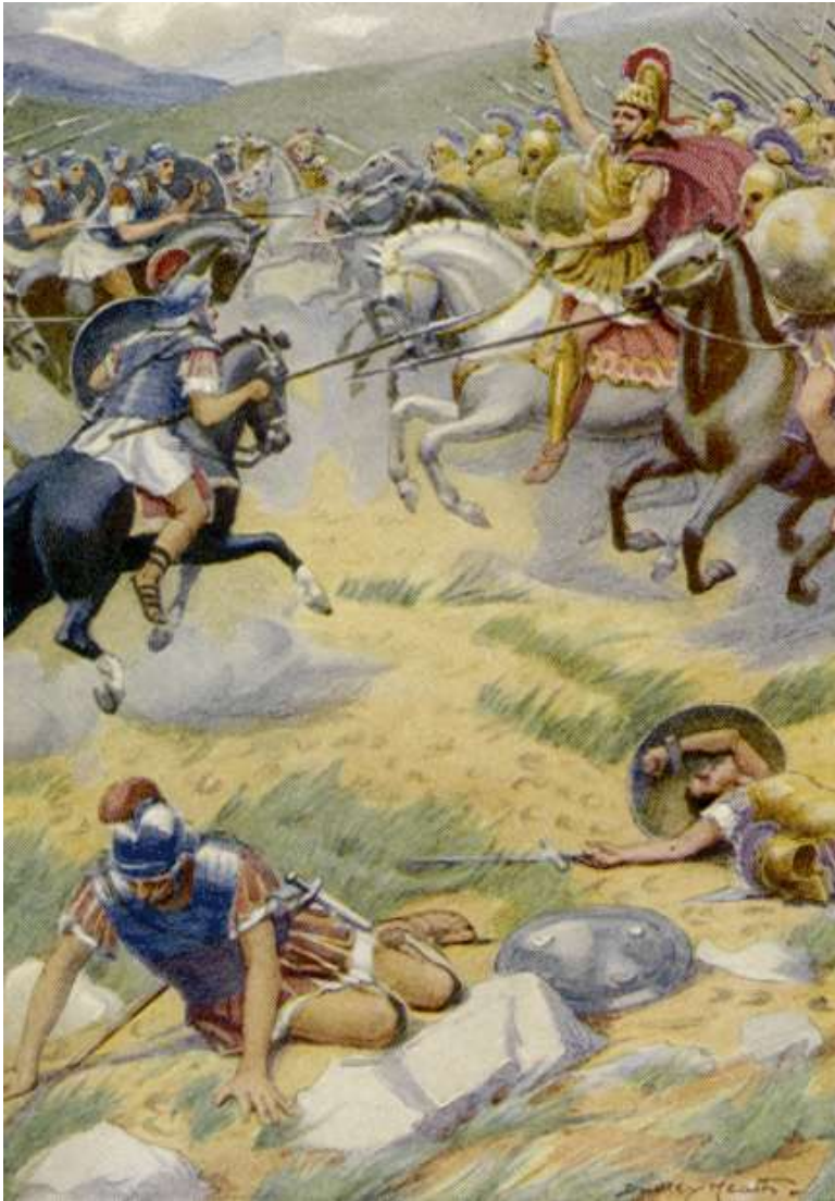
The armour of Pyrrhus was richer and more beautiful than that of his soldiers.

than that of his soldiers, at once attracted the attention of the Romans and drew on him the most determined attacks.