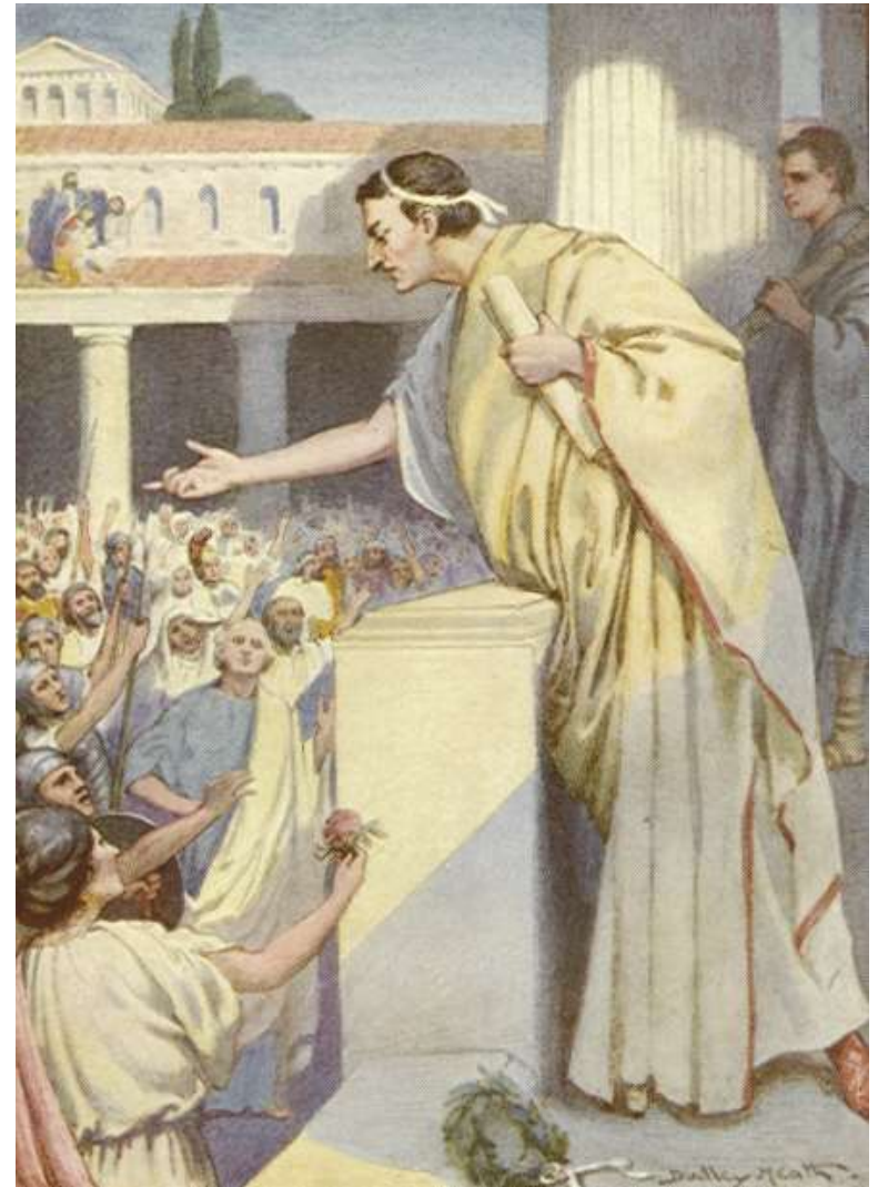
The following morning Cicero made another speech against Catiline.

Now there seemed reason to be alarmed, for it was known that troops were assembling near Fæsulæ, a small town about three miles from Florence. And not only so, but their captain was Manlius, an old officer of Sulla. Since the terrible proscriptions, it was natural that any one who had been connected with Sulla was feared as well as hated.