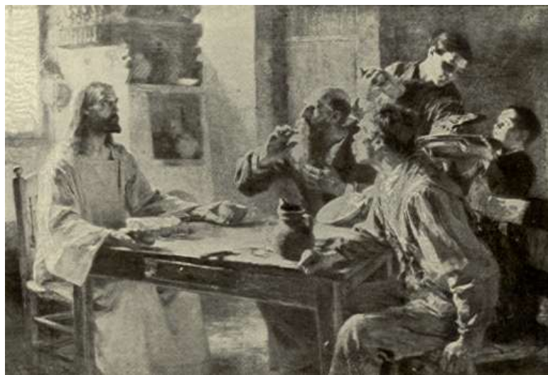
THE SUPPER AT EMMAUS

in to tarry with them. And it came time for supper, and they sat down together, Cleopas and his friend, and the women and the little children of the family, and the stranger. They asked the stranger to say the blessing. And as he said it he took bread and brake it and gave to them. And their eyes were opened, and they knew him. It was the Lord himself! And he vanished out of their sight.