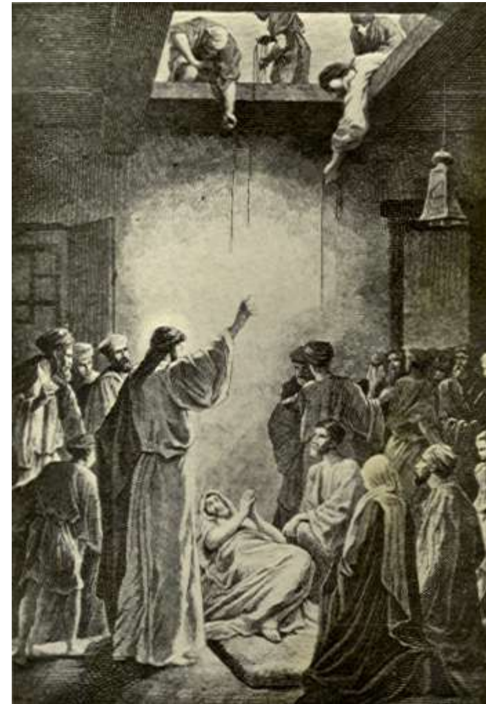
LETTING DOWN THE SICK MAN

forgives the sins of all those who are truly sorry and wish to be better. So he said, speaking very kindly and affectionately, "Son, thy sins be forgiven thee." For he knew that the soul is the most important part of a man, and that to have a sick soul is the worst of all possible ills; and he ministered to the sick soul before he did anything about the sick body.