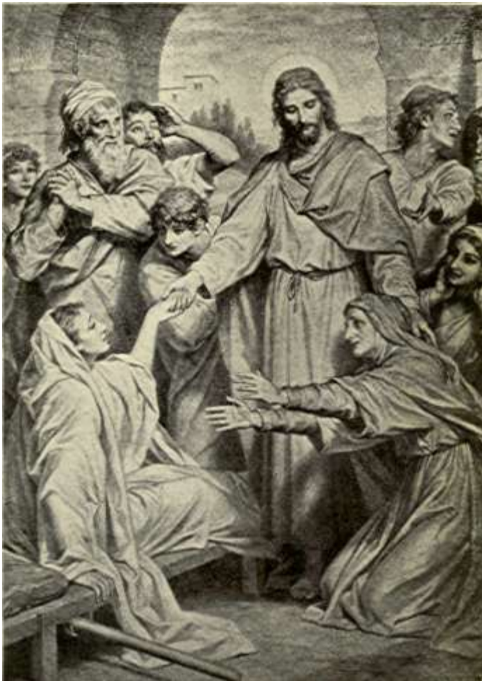
JESUS RAISING THE WIDOW OF NAIN'S SON

needed, are taken away. Then we may remember that day at Nain. God does not stop the funeral, but he cares. He is sorry for those who mourn. For he who came up the hill at Nain was in God, and God in him; and when we know him, we know God, as he said. And this, too, we know: that every morning God raises us from the death of sleep to the light of a new day; every morning he gives us back our life.