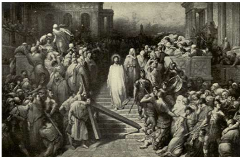
JESUS LEAVING THE PRAETORIUM

The death sentence was pronounced a little before nine o'clock. Since there was danger of disturbance when the pilgrims from Galilee should hear that the prophet of Nazareth was to be crucified, it was decided to proceed without delay. Our Lord's clothes having been put again upon his back, covering the wounds made by the scourge, he was led out on the way to the place of execution.