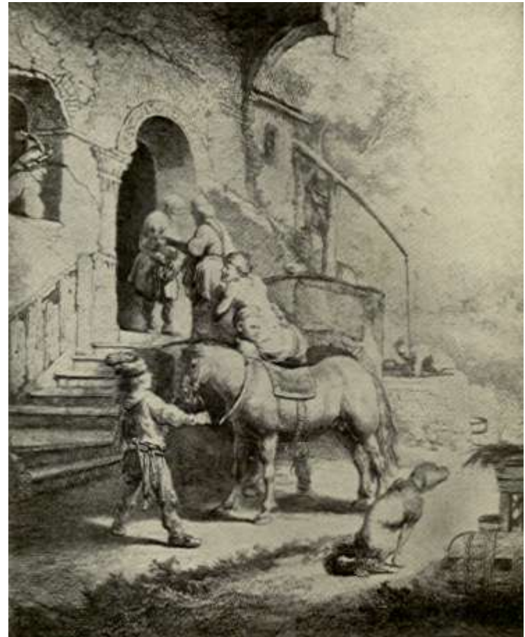
THE GOOD SAMARITAN

partly because of other red streaks which were not in the rocks, but were made by the blood of wounded men. Almost every day robbers would rush out upon some traveler and take away all that he had, leaving him bleeding by the wayside. That is why the man kept such a sharp lookout as he hurried along.