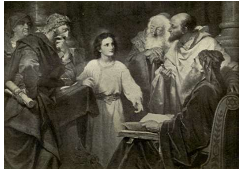
CHRIST IN THE TEMPLE

At last, they looked in the temple. There in one of the porches was a company of people sitting on the floor, as the custom was, and listening while wise men taught. The teachers were called doctors; not doctors of medicine, but doctors of divinity, teachers of religion. And in the midst of the gray-bearded doctors, not only hearing them but asking them questions, was the child Jesus, while all who heard him were astonished at his understanding and answers. And when his parents saw him they were both glad and amazed; glad to find him after their long search, but amazed that their son, this little lad of Nazareth, should be sitting so serenely in the midst of those learned people, understanding what they said.