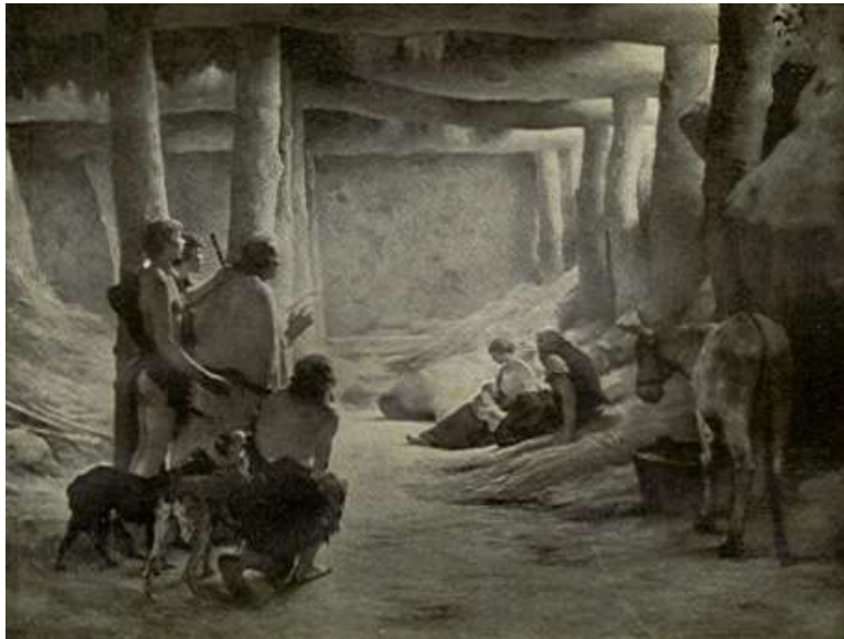
ARRIVAL OF THE SHEPHERDS

Then the chorus ceased, and the choir went back into heaven, shutting the golden gates behind them; and the night was dark and still again, and the shepherds were alone. So up they leaped, crying one to another with great joy, "Let us go to Bethlehem and see! Let us find the King!" And off they went, down the frosty road, their eager feet making a great noise in the silent night and their breath white behind them.