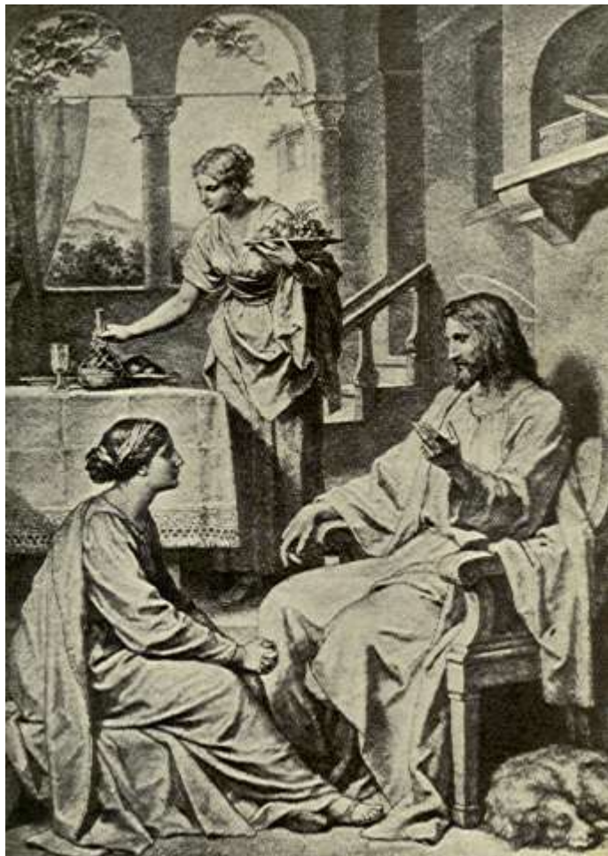
JESUS WITH MARY AND MARTHA AT BETHANY

party most of the good, earnest, religious people of the nation. It was the Pharisees who hated our Lord because he disregarded their customs.