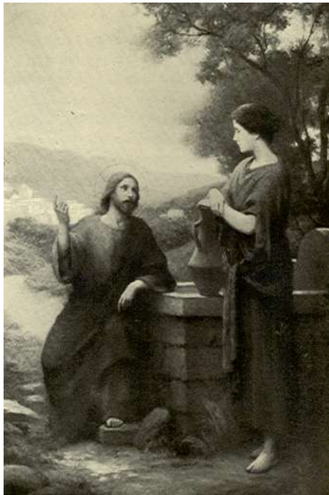
JESUS AND THE WOMAN OF SAMARIA

down on a stone by a well, and a Samaritan woman came to draw water. She was a Samaritan, and, besides that, a person of bad character; but our Lord spoke to her kindly. Sometimes, when the scribes wished to call him by a bad name, they said that he was a Samaritan himself, and that he was a friend of publicans and sinners. They felt towards publicans and Samaritans as people in some southern towns feel towards negroes.