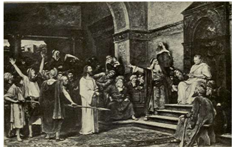
JESUS BEFORE PILATE

But Pilate did not believe it. He already knew something about Jesus. He knew that the priests had delivered him for envy, because they feared that he would influence the people against them. He knew that the King of the Jews had undertaken no quarrel against Rome. So he took Jesus into his palace, leaving the council and the crowd outside, and said, "Art thou the King of the Jews?" Jesus answered, "Why do you ask? Do you say this of yourself, or did others tell it of me?" Pilate replied, "Am I a Jew? Thine own nation and the chief priests have delivered thee unto me: what hast thou done?" Jesus said, "I am indeed a king, but not of an earthly kingdom. In my kingdom there is neither crown nor army. I was born and came into the world that I should bear witness to the truth. The kingdom of God which I preach is the kingdom of the truth." Pilate did not understand. "What is truth?" he said. But it was plain that here was no cause for the interference of a Roman governor. He went out to the multitude before the palace door, and said, "I find no fault in him at all."