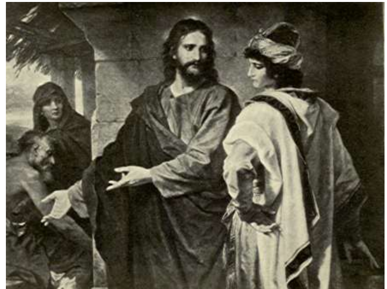
JESUS AND THE RICH YOUNG MAN

heaven: and come, follow me." You see how hard it was. Our Lord did not say that to other rich men; he said it to this rich man because it was exactly what he needed. The man had never done anything bad, but, on the other hand, he had never done anything good. He had lived a perfectly proper, but a very selfish life. His only way was to break with it all, to give it all up, and come out into a totally different manner of living. But the young man rose slowly from his knees, with a long face, and turned about and went away. He felt that that was too much.