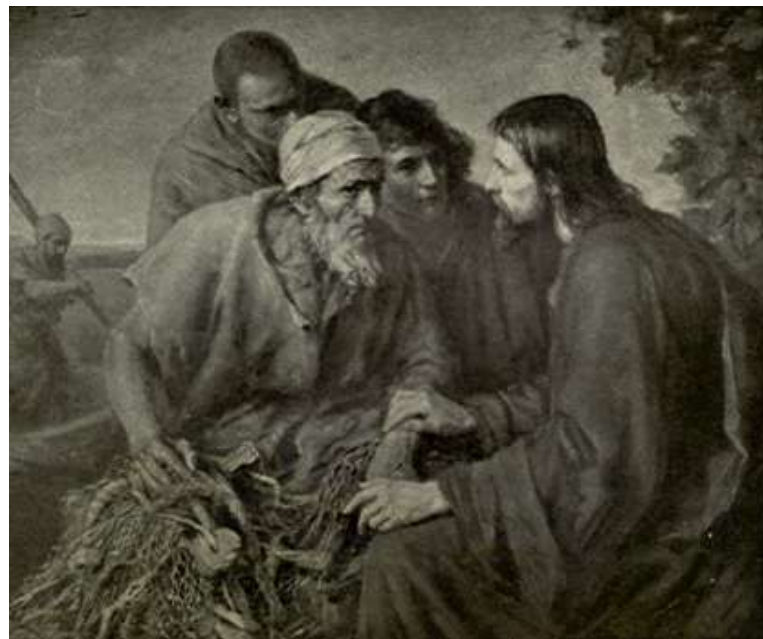
CHRIST AND THE FISHERMEN

for the lake was subject to sudden storms. In such a life, these six—if we may count the friend from Cana—had passed their days since they were boys; and all that time had been good friends, not only fishing together, but talking together,—talking about the sermons at the synagogue, and the true life, and the world in which they lived, and God above them and beside them. They were just the men whom the King wanted, manly and open-minded.