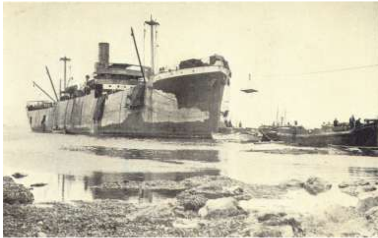
THE S.S. RIVER CLYDE .

hundred brave men gave their lives thus: every man there earned the Cross that day: a boy earned it by one of the bravest deeds of the war, leaping into the sea with a rope in his teeth to try to secure a drifting lighter.