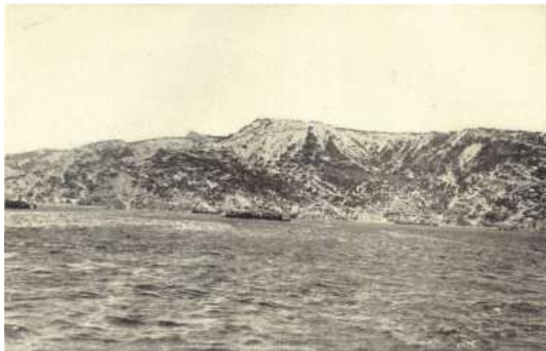
ANZAC FROM THE SEA.

newly arrived 42nd Division. Our men advanced after a prolonged and terrible bombardment, which so broke down the Turk defence that the works were carried all along the line, except in one place, on the left of the French sector and in one other place, on our own left, near the sea. Our advance, as before, varied in depth from a quarter of a mile to six hundred yards; all of it carried by a rush, in a short time, owing to the violence of the artillery preparation, though with heavy losses from shrapnel and machine-gun fire. In this attack, the 42nd or East Lancashire Division received its baptism of fire. Even those who had seen the men of the 29th Division in the battles for the landing admitted that "nothing could have been finer" than the extreme gallantry of these newly landed men. The Manchester Brigade and two companies of the 5th Lancashire Fusiliers advanced with the most glorious and dashing courage, routed the Turks, carried both their lines of trenches; and one battalion, the 6th, very nearly carried the village of Krithia; there was, in fact, no entrenched line between them and the top of Achi Baba.