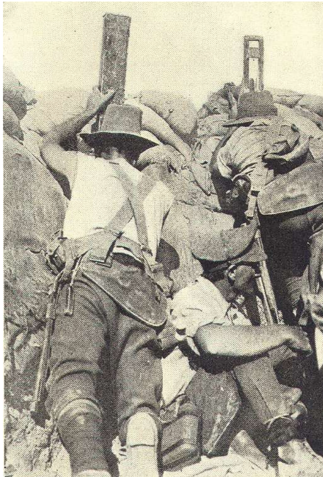
INSIDE AN AUSTRALIAN TRENCH.

Roland, the unheard, unheeded horn, the horn of heroes in the dolorous pass, asking for the little that heroes ask, but asking in vain. If ever the great of England cried from beyond death to the living they cried then. "De ço qui Galt. Demuret i unt trop."