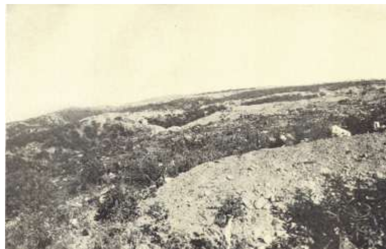
A "LONG FOCUS" VIEW TAKEN OVER THE TOP OF OUR TRENCHES AT ANZAC.

because it was the first by which the main part of the reinforcements would be ready, the latest, because of the moon." Both in the preparation and the surprise of this attack dark nights were essential.