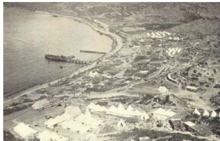
VIEW OF ANZAC, LOOKING TOWARD SUVLA.

thought. Such a scheme of battle, difficult to think out in the strain of holding on and under the temptation to go slowly, improving what was held, was also difficult to execute. Very few of the great battles of history, not even those in Russia, in Manchuria, and in the Virginian Wilderness have been fought on such difficult ground, under such difficult conditions.