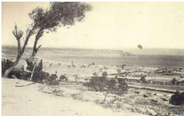
A VIEW SHOWING MORTE BAY, DE TOTT'S BATTERY, AND THE ASIATIC COAST.

They left the harbour very, very slowly; this tumult of cheering lasted a long time; no one who heard it will ever forget it, or think of it unshaken. It broke the hearts of all there with pity and pride: it went beyond the guard of the English heart. Presently all were out, and the fleet stood across for Tenedos, and the sun went down with marvelous colour, lighting island after island and the Asian peaks, and those left behind in Mudros trimmed their lamps knowing that they had been for a little brought near to the heart of things.