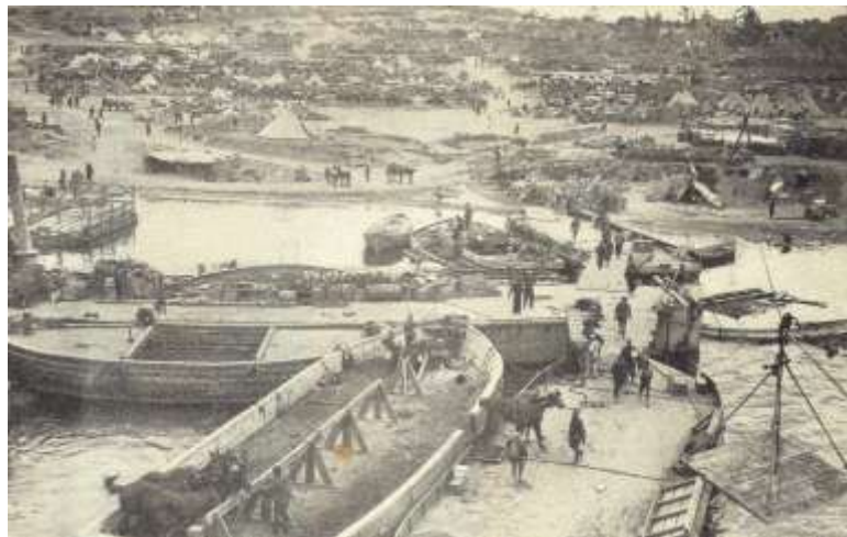
A REMARKABLE VIEW OF V BEACH, TAKEN FROM S.S. RIVER CLYDE .

shore. The ship's upper deck and bridge were protected with boiler plate and sandbags, and a casement for machine guns was built upon her fo'c'sle, so that she might reply to the enemy's fire.