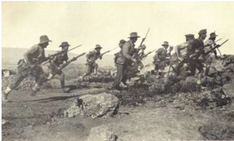
AUSTRALIANS AT WORK AT ANZAC TWO DAYS BEFORE THE EVACUATION TOOK PLACE.

which they were simultaneously to appear." The vital part of the fight was to be fought by troops from Anzac. The Anzac position was an open book to every Turk aeroplane and every observer on Sari Bair. The reinforcements for this part of the battle had to be landed in the dark, some days before the battle, and kept hidden underground, during daylight, so that the Turks should not see them and suspect what was being planned.