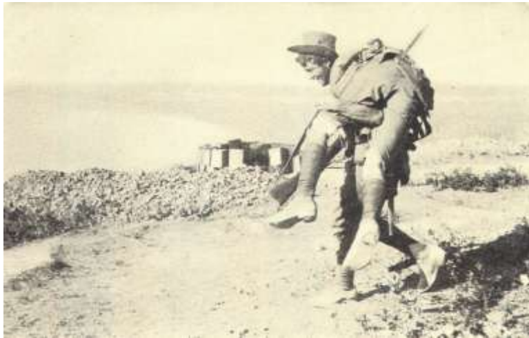
AN AUSTRALIAN BRINGING IN A WOUNDED COMRADE TO HOSPITAL.

"Were our 100,000 men in Gallipoli containing a sufficiently large army of Turks to justify their continuance on the Peninsula?" and "Could they be more profitably used elsewhere?" arose in the minds of the High Direction from week to week as the war changed.