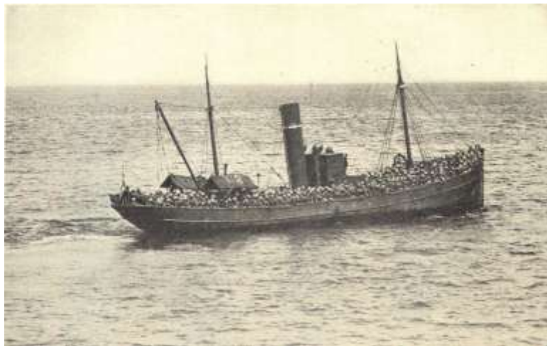
A BOATLOAD OF BRITISH TROOPS LEAVING THE S.S. NILE FOR ONE OF THE LANDING BEACHES.

nights of the 3rd, 4th and 5th of August. During those nights, the Australians landed, carried inland and hid not less than one thousand tons of shells, cartridges and food, some hundreds of horses and mules, many guns, and two or three hundred water-carts and ammunition carts. All night-long, for those three nights, the Australians worked like schoolboys. Often, towards dawn, it was a race against time, but always at dawn, the night's tally of new troops were in their billets, the new stores were under ground and the new horses hidden. When the morning aeroplanes came over, their observers saw nothing unusual in any part of Anzac. The half-naked men were going up and down the gullies, the wholly naked men were bathing in the sea, everything else was as it had always been, nor were any transports on the coast. For those three nights nearly all the Australians at Anzac gave up most of their sleep. They had begun the work by digging the cover, they took a personal pride and pleasure in playing the game of cache-cache to the end.