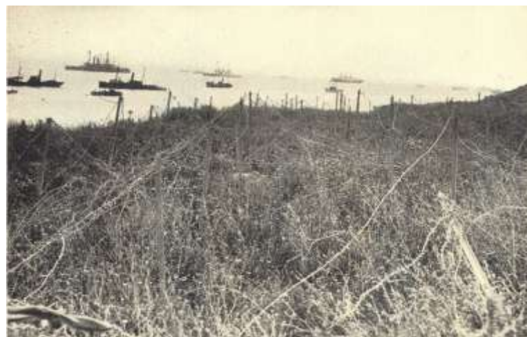
SOME OF THE BARBED WIRE ENTANGLEMENTS NEAR SED-DUL-BAHR.

400 Turkish prisoners. This landing of the French diverted from us on the 25th the fire of the howitzers emplaced on the Asiatic shore. Had these been free to fire upon us, the landings near Sedd-el-Bahr would have been made even more hazardous than they were.