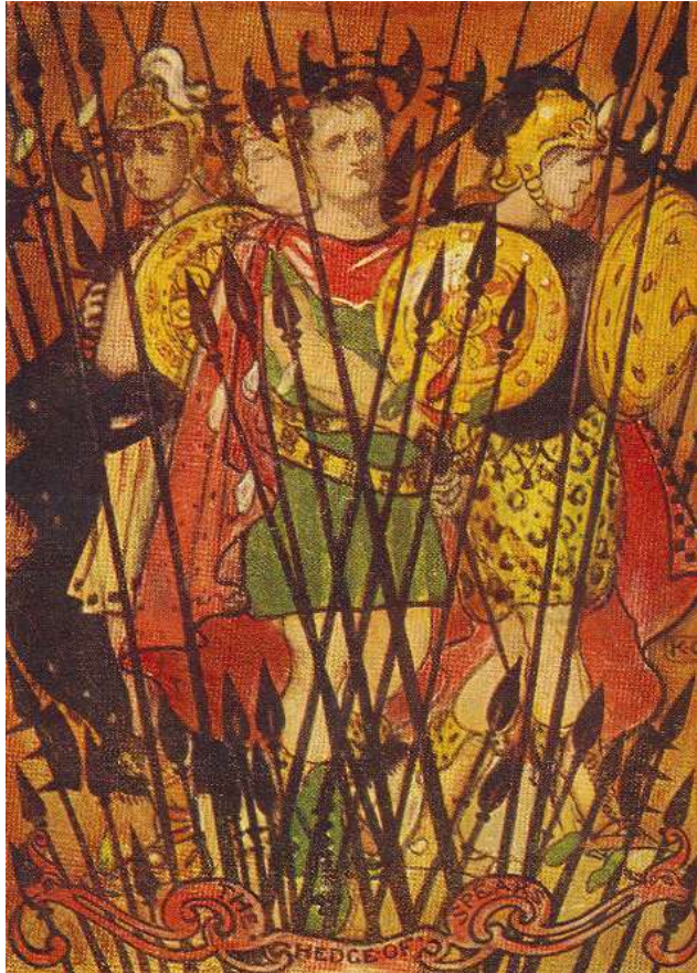
THE HEDGE OF SPEARS

"If such be our doom, then slay me first," said Ardan, "for I am the youngest of Usna's sons."