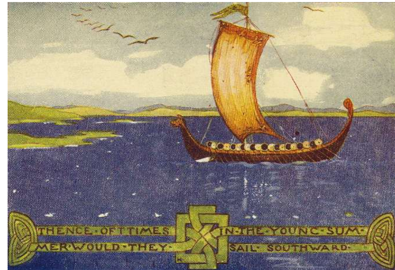
... IN THE YOUNG SUMMER WOULD THEY SAIL SOUTHWARDS.

shepherds and nesting birds, and here, in all the glory of spring, did the sons of Usna make their home. Nor was it long before the chiefs of the mountain-lands swore allegiance to Nathos and did him homage, and he was as a king among the people of his mother's land.