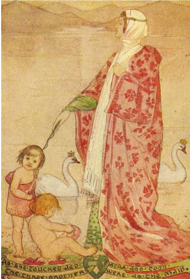
...AS SHE TOUCHED AED, FIACRA, AND CONN, THE THREE BROTHERS WERE AS THE MAID.

Not until they reached a still lake were the horses unyoked for rest. There Eva bade the children undress and go bathe in the waters. And when the children of Lir reached the water's edge, Eva was there behind them, holding in her hand a fairy wand. And with the wand she touched the shoulder of each. And, lo! as she touched Finola, the maiden was changed into a snow-white swan, and behold! as she touched Aed, Fiacra, and Conn, the three brothers were as the maid. Four