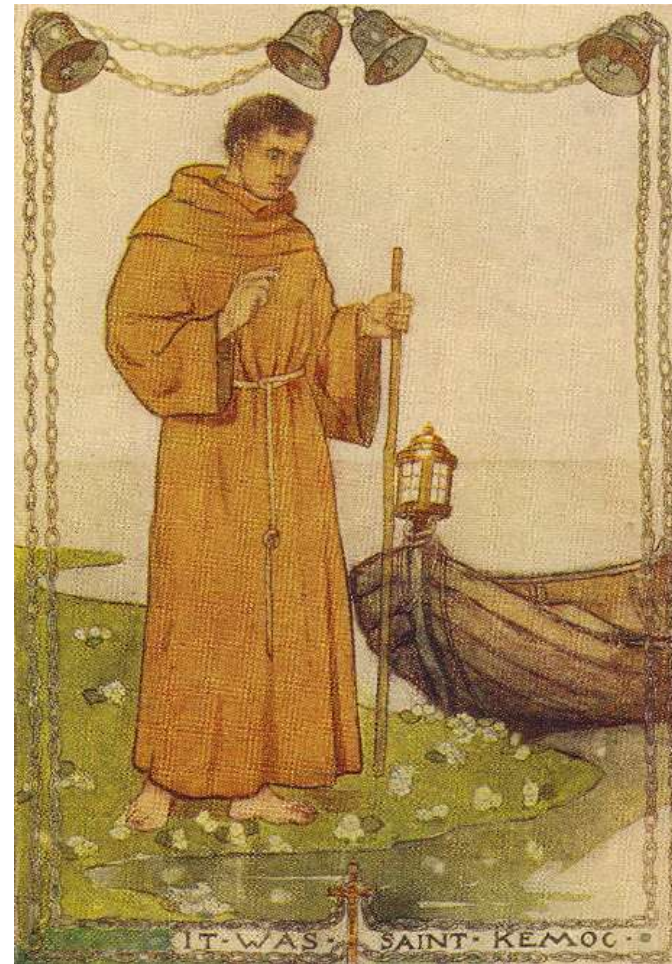
IT WAS SAINT KEMOC.

palace. And that same night she set out for her father's kingdom in the south.