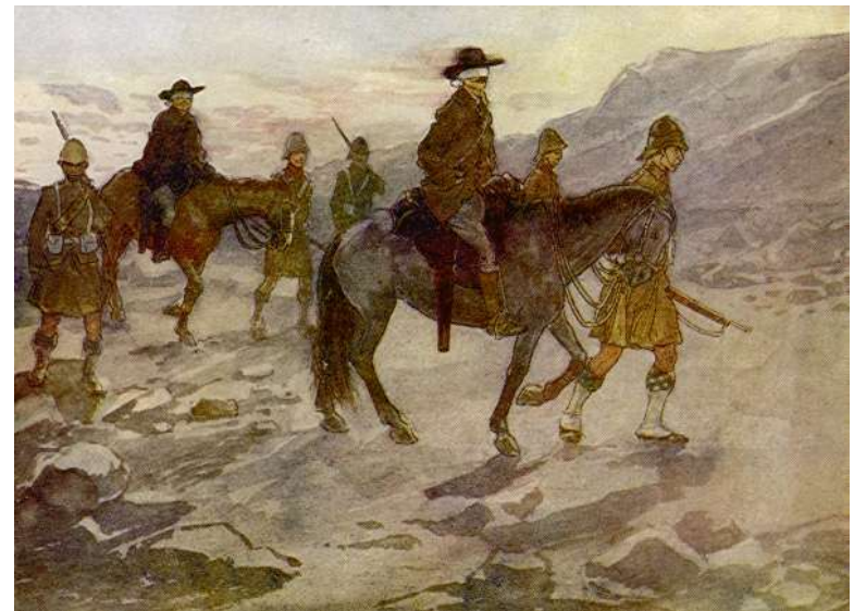
The Boer leaders were blindfolded and guarded by soldiers of the Black Watch.

But in the darkest hour one thing became certain. The little island was not fighting alone. The Empire of Greater Britain was no mere name. From all sides, from New Zealand, Australia, Canada, from every province of Greater Britain, from every land over which the Union Jack floats, came offers of help. Britain was fighting, not for herself, but for her colony, and right or wrong, her colonies stood by her, side by side, and shoulder to shoulder.