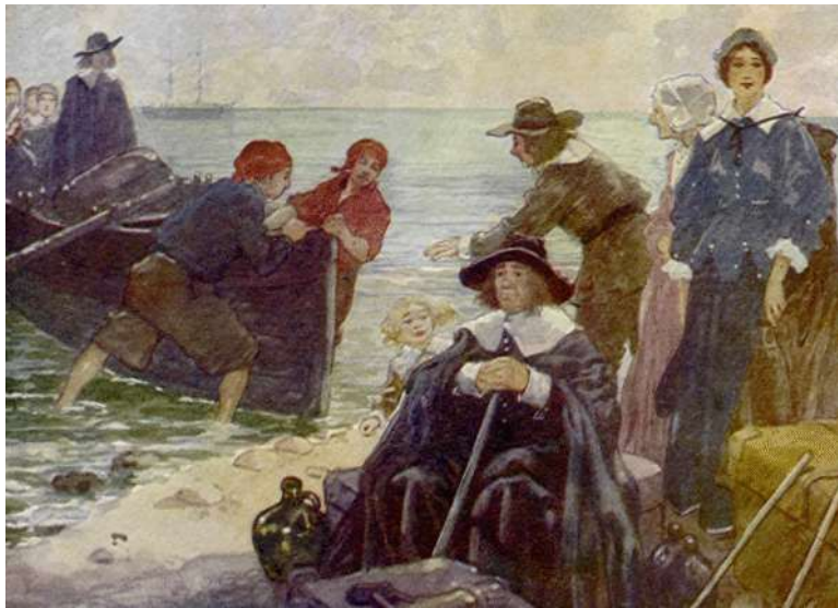
"A band of exiles moor'd their bark on the wild New England shore."

Yes, call it holy ground, which first their brave feet trod! They have left unstain'd what there they found, freedom to worship God!