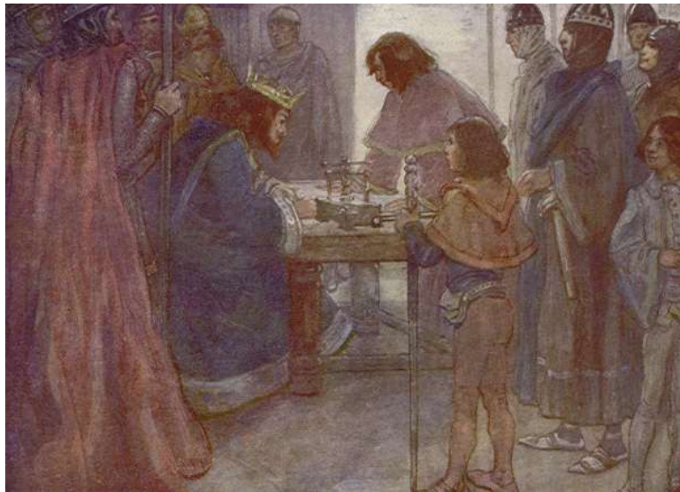
The Great Charter was sealed with the King's seal.

The angry barons would no longer be put off. They forced the King to meet them at a little place on the Thames called Runnymede. The barons and their army camped on one side of the river, the King and his friends on the other. On a little island between, they met and talked, and there, on 15th June 1215 A.D., the Great Charter was sealed with the king's great seal.