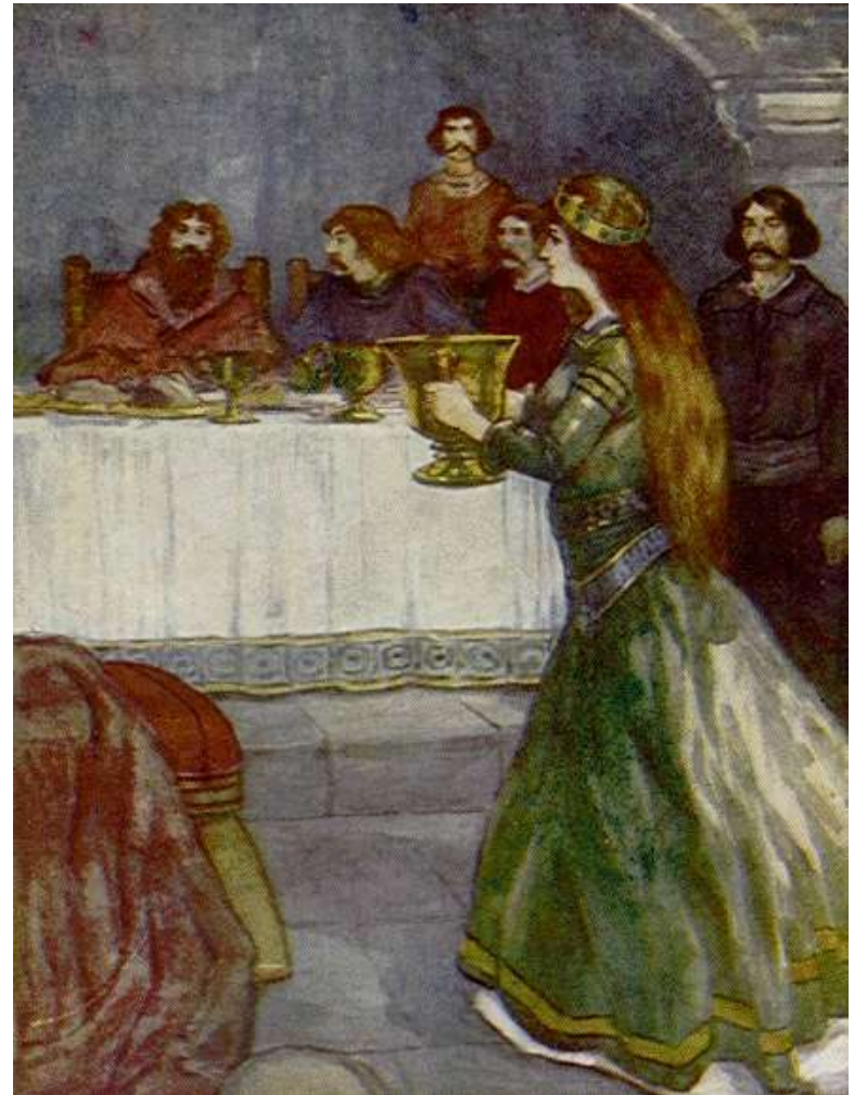
Rowena came into the room carrying a beautiful golden cup.

rather afraid of them, so he said nothing, but allowed them to build their fortress. It was called Thong Castle, and stood not far from Lincoln, at a place now called Caistor.