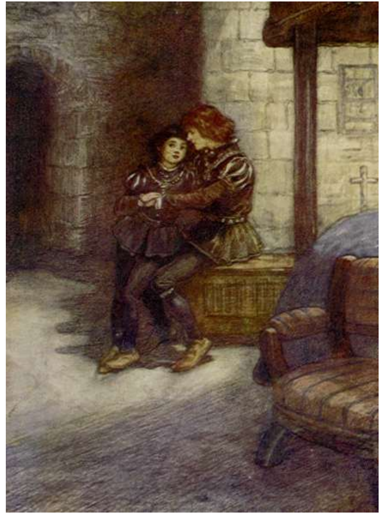
"THE DAYS SEEMED VERY LONG AND DREARY TO THE TWO LITTLE BOYS"

That night the little Princes went to sleep with their arms round each other's necks, each trying to comfort the other. They lay together in a great big bed, happy in their dreams, with tears still wet upon their cheeks.