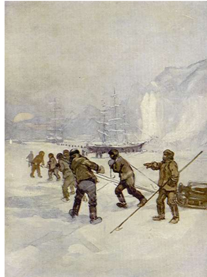
THE SHIPS WERE CALLED THE "TERROR" AND THE "EREBUS"

already been on two voyages of discovery to Arctic regions, was put in command.