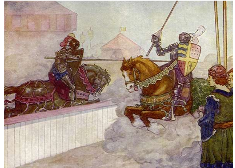
The Count rode again and again at Edward till his lance was splintered in his hand.

not touch it." So the count was obliged to give up his sword to a common soldier, which, for a true knight, was the deepest disgrace.