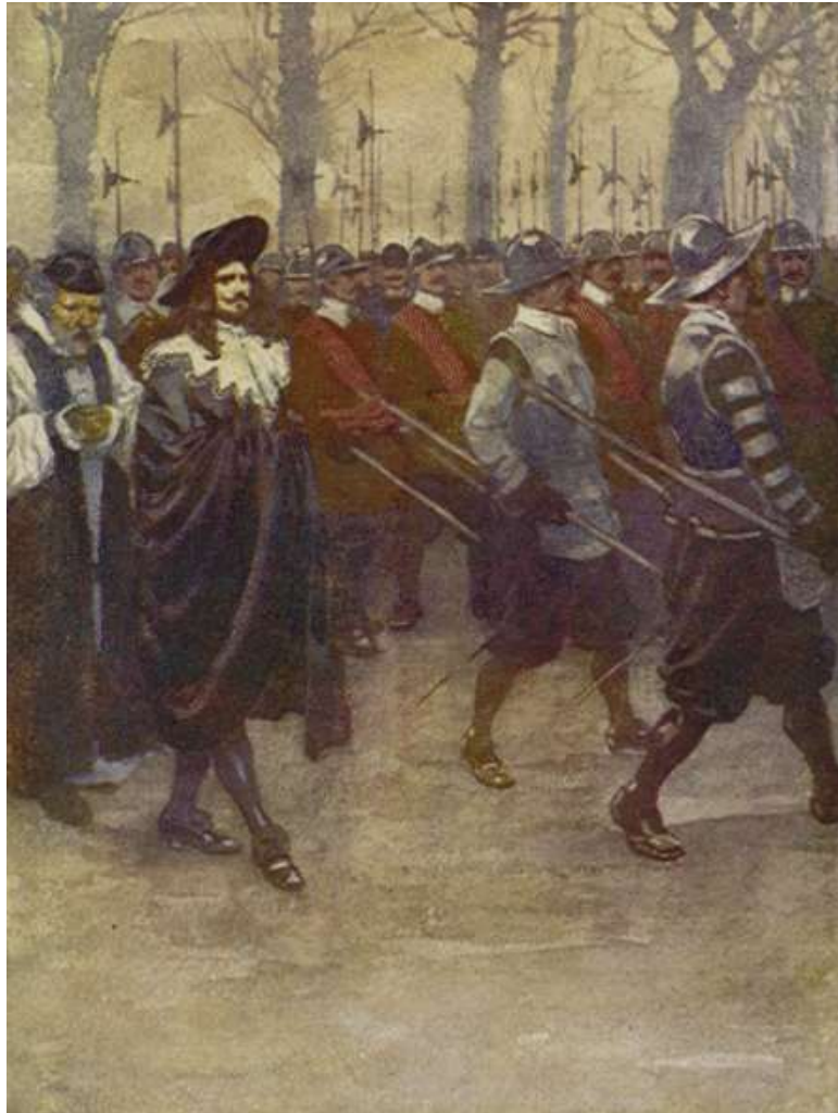
CHARLES THE KING WALKED FOR THE LAST TIME THROUGH THE STREETS OF LONDON

thought that he was going to friends, he found that he was again a prisoner, and more carefully guarded than before.