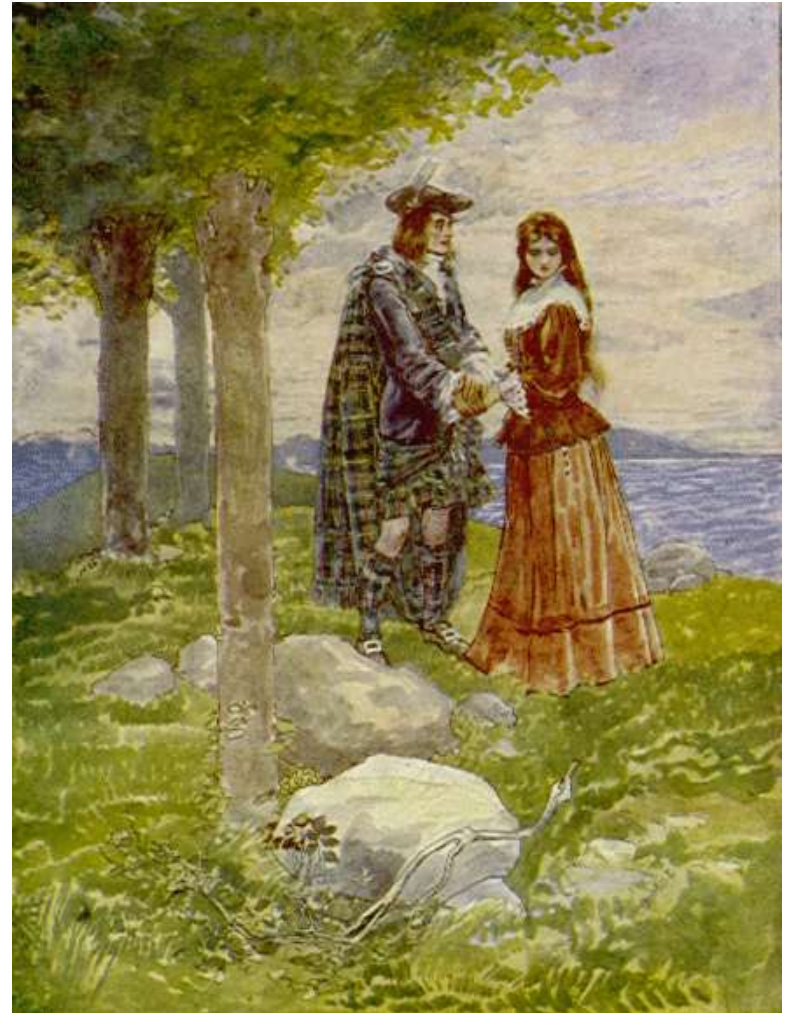
They took a sad farewell of each other.

When there was no need for Flora to go further with the Prince, they took a sad farewell of each other. “I hope, madam,” said he, bending over her hand and kissing it, “we shall yet meet at St. James’s.” By that he meant that he still hoped to be King some day, and welcome her in his palace of St. James’s in London. Then he stepped into the boat which was waiting for him, and Flora sat sadly by the shore, watching it as it sailed farther and farther away.