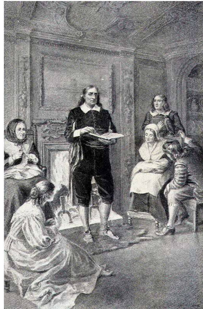
CROMWELL READING TO HIS FAMILY.

A compromise was finally reached. The Protector accepted "The Humble Petition and Advice," by which a Second Chamber was to be created, with members chosen by himself, to sit for life. He accepted the authority to nominate his successor, but he refused the title of King.