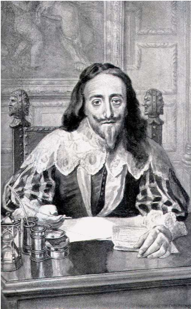
FOR TWO DAYS HE WAS TORN BY INDECISION, AND THEN SIGNED.

The reform party now prepared a Grand Remonstrance, and in November 1641, Pym placed it before the Commons. In it were detailed the work that had been accomplished, the difficulties that had been surmounted, and the new dangers which had to be faced. Pym's hold on his party had slackened, for many men had changed sides. A fierce discussion took place and there was a scene of tumult in the House. Members lost control of themselves, waved their hats and unsheathed their swords, until it seemed as if the verbal warfare would end in actual strife. After a debate of sixteen hours the Remonstrance was carried by the narrow majority of eleven. As the Chimes of St Margaret's were striking two the members passed out on their homeward way. Cromwell, walking down the stairs with Lord Falkland, emphasized his view of the momentousness of the issue. "If the Remonstrance had been rejected," he declared, "I would have sold all I had the next morning, and never have seen England any more; and I know there are many other honest men of this same resolution."