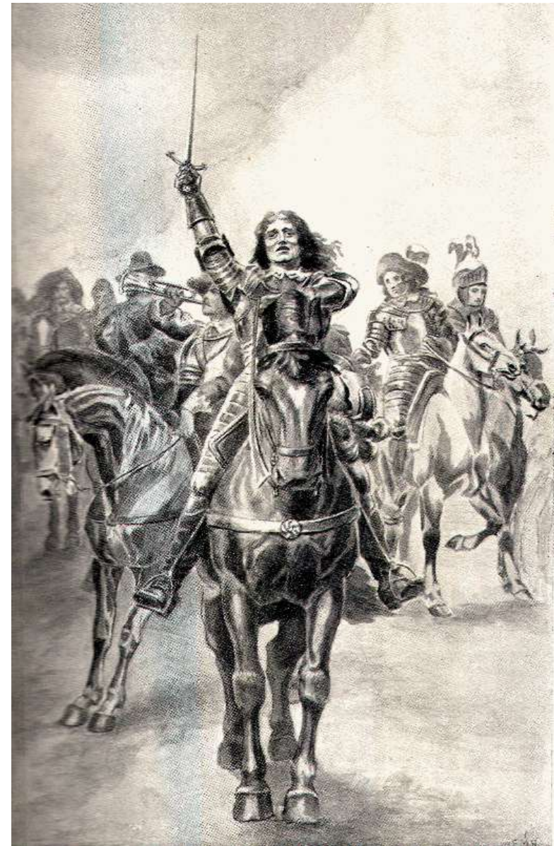
PRINCE RUPERT AT EDGEHILL

consequences, and in after years he himself spoke of that interview: