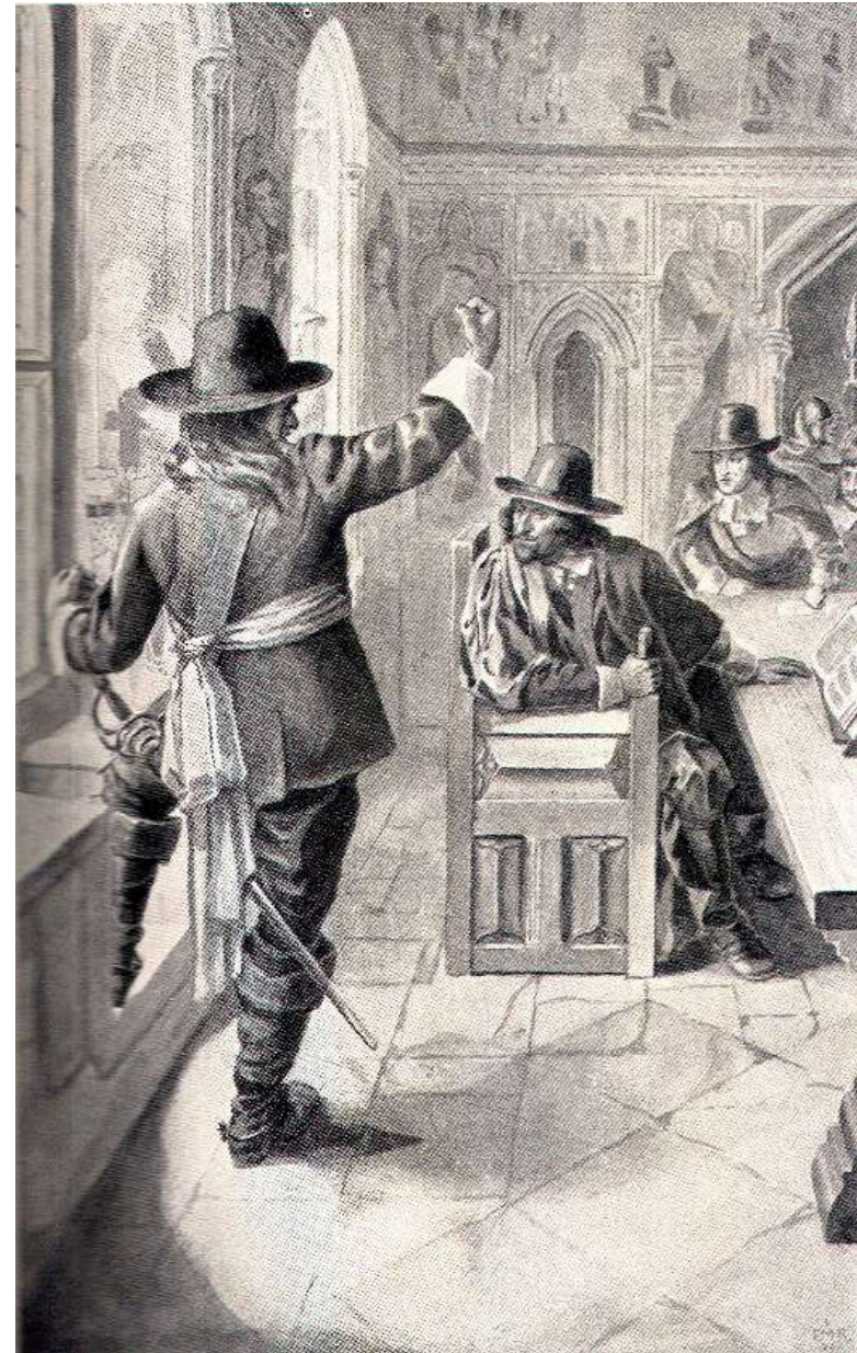
"MY MASTERS, HE IS COME, HE IS COME."

though he was not a party to this act of military despotism, yet approved of it.