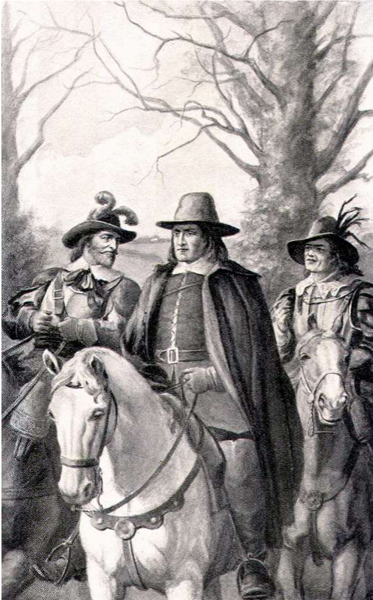
HE WAS SENT IN CUSTODY TO LONDON.