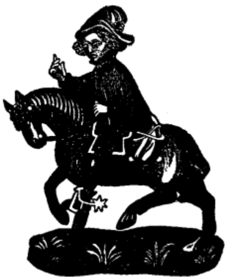
The Canon's Yeoman

While the pilgrims were riding onward at a good pace, two men were galloping after them at full speed. They proved to be a canon and his servant, or yeoman, and they had been doing their best to catch up with the company. The yeoman was especially ready to talk, and before long he had explained that his lord was a great alchemist. "He could even pave with gold and silver all this ground over which we have been riding," he declared.