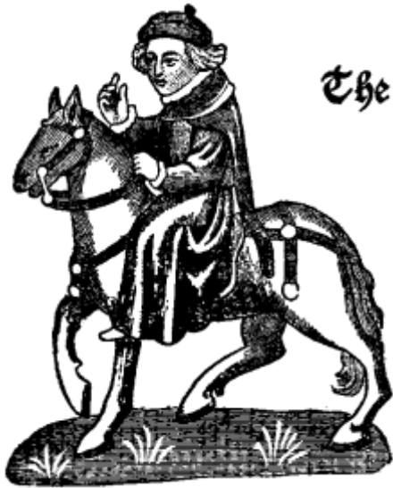
The Nun's Priest

When the prioress had ended her story of little Hugh of Lincoln, the whole company looked thoughtful. This did not suit the cheerful host. He turned to the nun's priest and said, "Come, you Sir John, tell us some pleasant tale to make us merry."