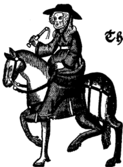
The Wife of Bath

The next pilgrim called upon for a tale was the wife of Bath. She chose to tell one of the days of King Arthur.