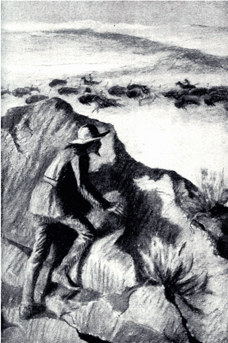
IN THE DISTANCE I SAW A LARGE HERD OF BUFFALO WHICH WERE BEING CHASED AND FIRED AT BY TWENTY OR THRITY INDIANS.

to march, having made one hundred and twenty miles in twenty-two hours.