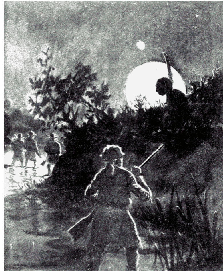
HE SAW THE FEATHERED HEAD OF AN INDIAN POKE OVER THE BANK BEFORE HIM.

consented; and there is an interesting document which was signed by the two which shows what was expected and what were the dangers of such work. This paper reads as follows: