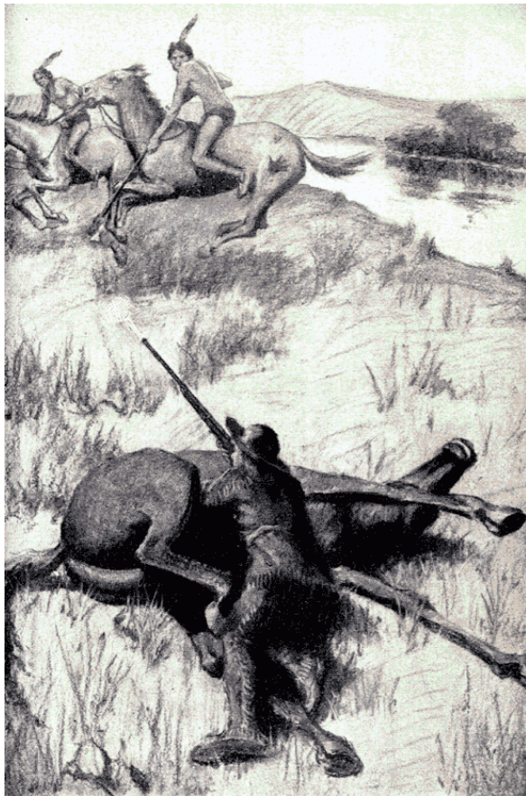
I DISENTANGLED MYSELF AND JUMPED BEHIND THE DEAD BODY OF MY HORSE.

The following chapters were written by Buffalo Bill himself and tell his personal story regarding events described in the previous biography.