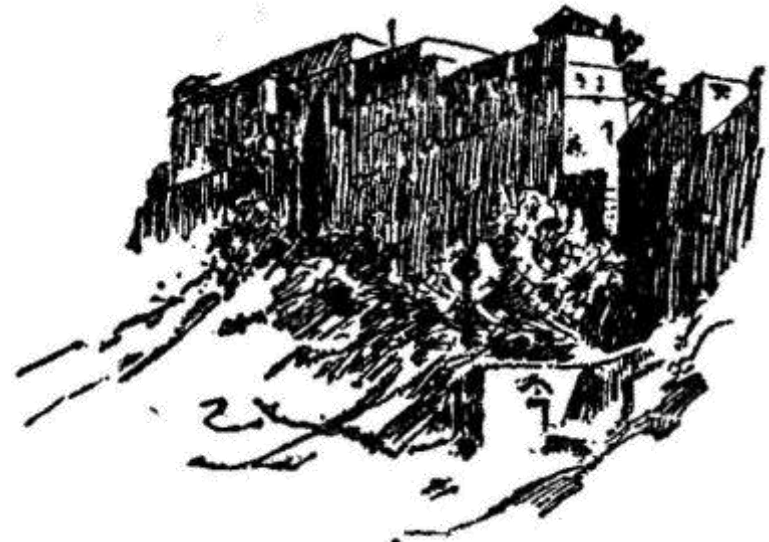
WALLS OF THE KASBAH, ALGIERS.