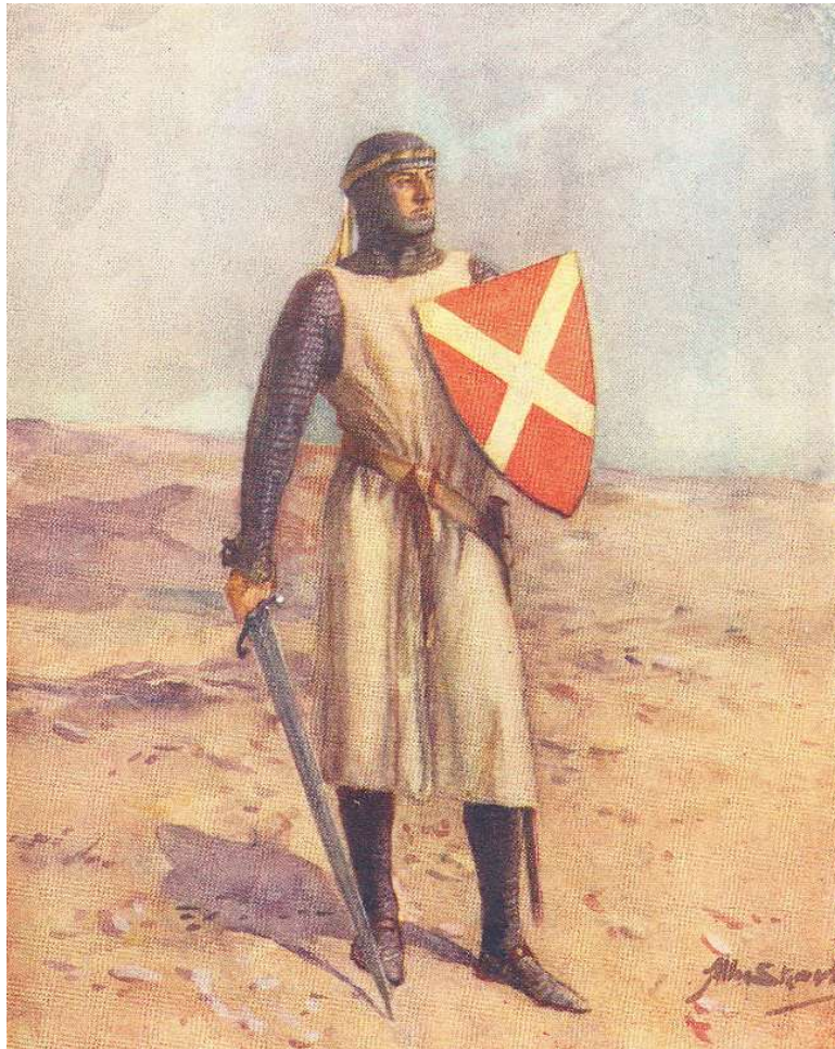
KNIGHT OF ST. JOHN.

than eight thousand Turks had been slain before the walls, and this was but a small outlying fort, while the greater forts still stood, grim and frowning, across the harbour. "If the child has cost us so dear, what will the parent cost?" said Mustapha, the Turkish general.