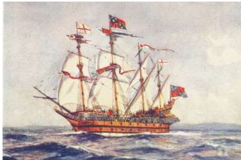
AN ENGLISH ROUND-SHIP.

Between 1609 and 1616 the Algerine rovers captured the huge number of four hundred and sixty-six British vessels, and carried their crews into slavery.