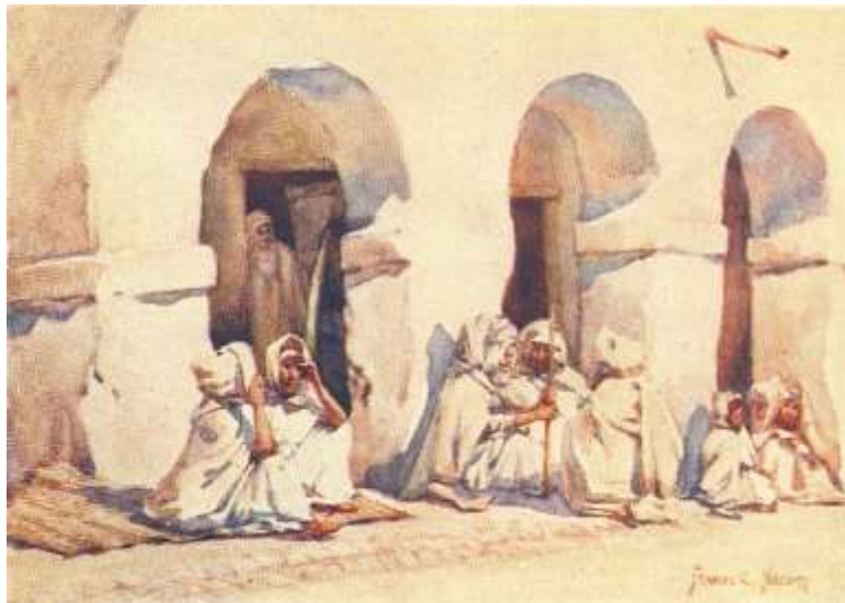
GUARDING THE CAPTIVES.

Christian slaves who pulled her oars were all chained to the rowing benches. This was done lest in the hour of battle against a Christian vessel the slaves should rise upon their masters, to aid their friends in the other vessel and win their freedom. And chained to those benches the poor creatures remained until the cruise was over, even if it should last for months. Upon these narrow seats they were packed so closely, sometimes five, six, or seven men to an oar, that it was not possible for them to sleep at full length, and they crouched together in hopeless misery. Their food was ships' biscuit and water, with an occasional spoonful of rice or gruel. Nor did they get too much of that, for great quantities of food were difficult to carry, and when hard rowing was needed, the whip took the place of provender.