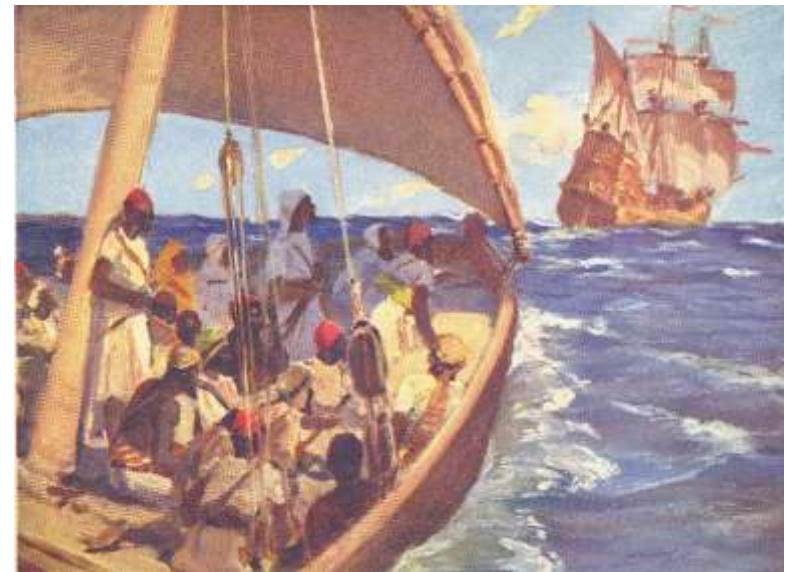
CORSAIRS CHASING A GALLEON.

centuries that slipped by while the Barbary coast with its Moslem rovers remained the terror of all Christian shipping. The Corsairs attacked all alike. Their prisons were full of captives of all nations. English, Dutch, Spanish, French, Italians, every speech in Europe could be heard in the mouths of their slaves. Every rank, too, was there. Gentlemen and ladies, travelling abroad for business or pleasure, were often seized on board ships; and these, perhaps with their children, all became captives, and were sold for the benefit of their captors, or were forced to pay heavy ransoms.