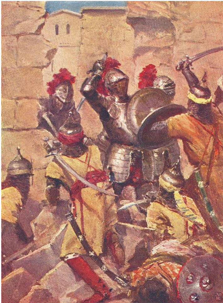
THE HEROIC DEFENSE OF FORT ST. MICHAEL.

Knights sallied and cut them in pieces. The Corsairs fled towards the harbour, but fled in vain. So confident had they been of victory that they had dismissed their ships, and they were driven pell-mell into the sea, where they were slain or drowned in great droves. The reddened waves were dotted with drums and flags, and turbans which had floated from the heads of the drowning Moslems.