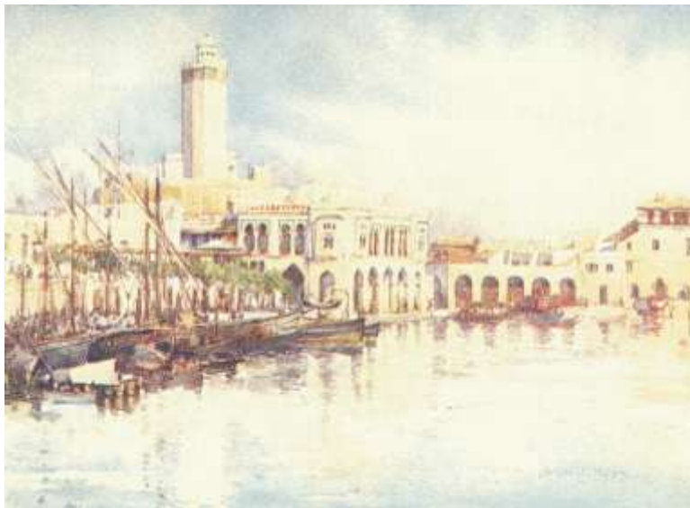
THE HARBOR OF ALGIERS.

Again the ships were assailed by a most dreadful storm, and were driven hither and thither by the gale. Some were wrecked near Algiers and their crews seized by the pirates. It was only with the greatest difficulty that Charles himself made the homeward voyage in safety, leaving many of his soldiers and sailors in the hands of the enemy. "Algiers teemed with Christian captives, and it became a common saying that a Christian slave was scarce a fair barter for an onion."