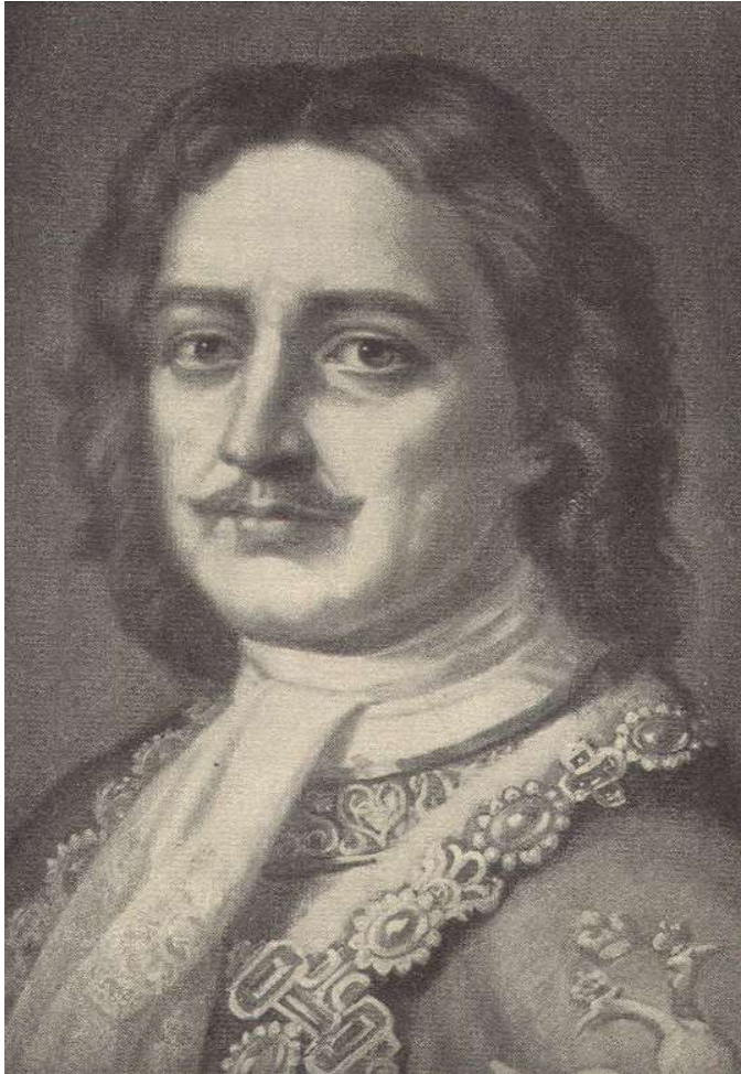
PETER THE GREAT.