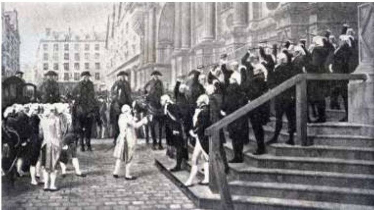
THE ARCH OF STEEL.

favourite meeting-place. His gipsy face and long black hair inspired others with the same frenzy as he spoke of the "St Bartholomew's bell of patriots," which had now been rung. The Swiss and German mercenaries would come and kill the French by order of the Queen, who had sent their minister away. There was no time to lose if they intended to save themselves. Let all wear a green cockade, for green was the colour of eternal hope, and the trees could furnish leaves abundantly.