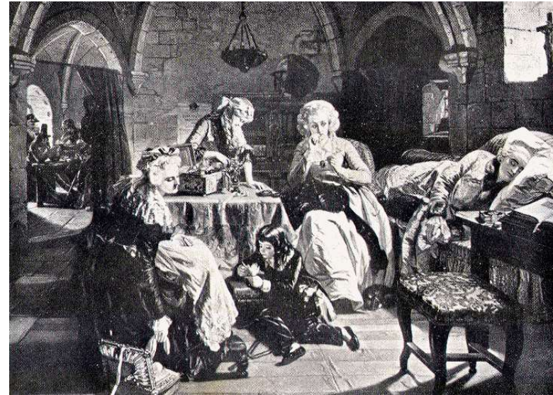
THE ROYAL FAMILY IN THE TEMPLE.

though his mother begged more humbly than she had ever thought to do.