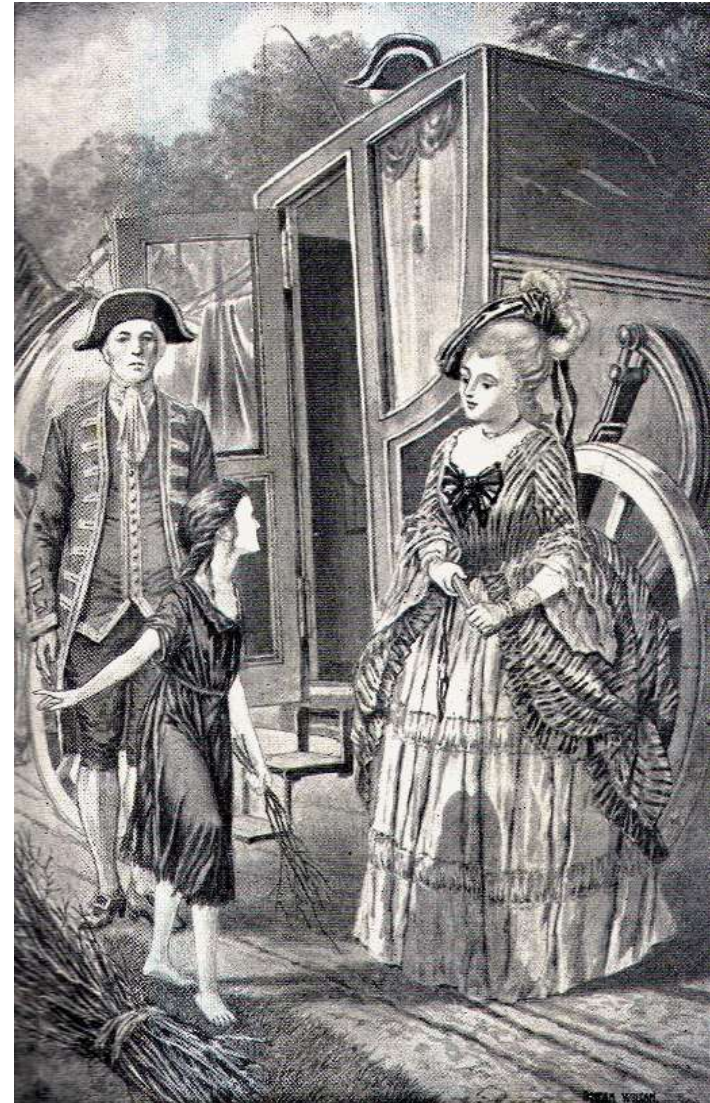
LITTLE JEANNE DE VALOIS.

when she was introduced to the Grand-Almoner, and made a tool of him to gain her own ends.