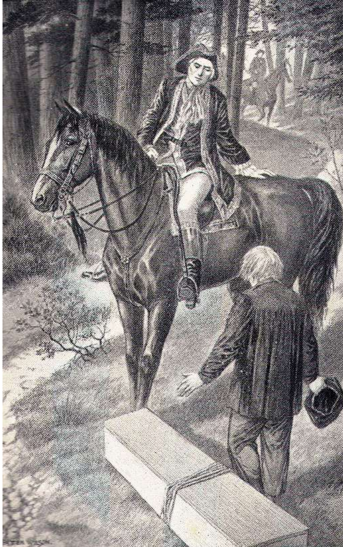
"FOR MY FATHER, SIRE."

eager nobles. "The King is dead. Long live the King!" In France it was an ancient law that there must always be a sovereign.