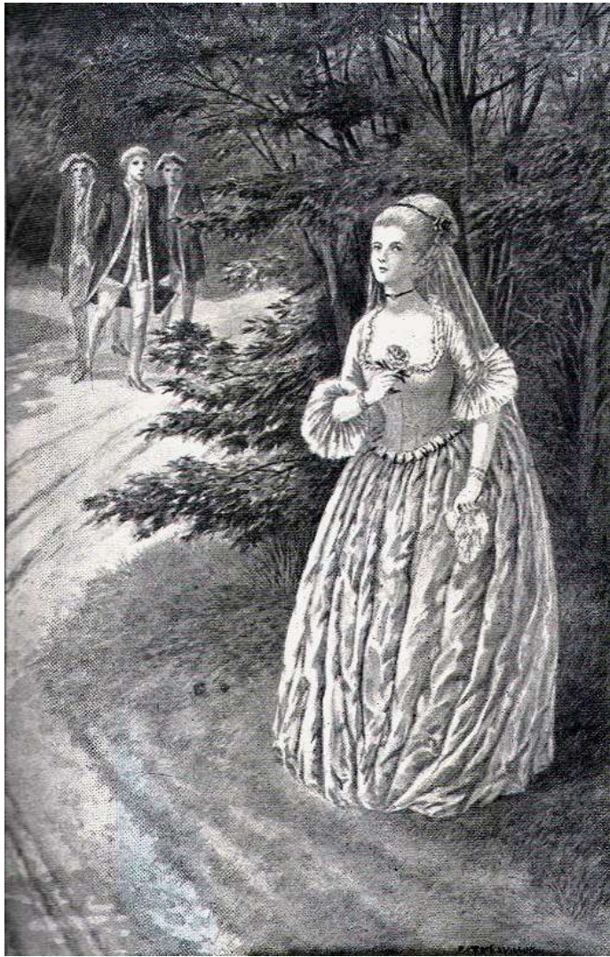
IN THE SHADOW OF A HORNBEAM HEDGE.

Madame de la Motte found her victim generous after the signal honour he had experienced from the pretended Queen. She resolved to plot again, this time remembering that Marie Antoinette loved jewels. There was a certain diamond necklace which Louis XV had ordered for Madame Dubarry,